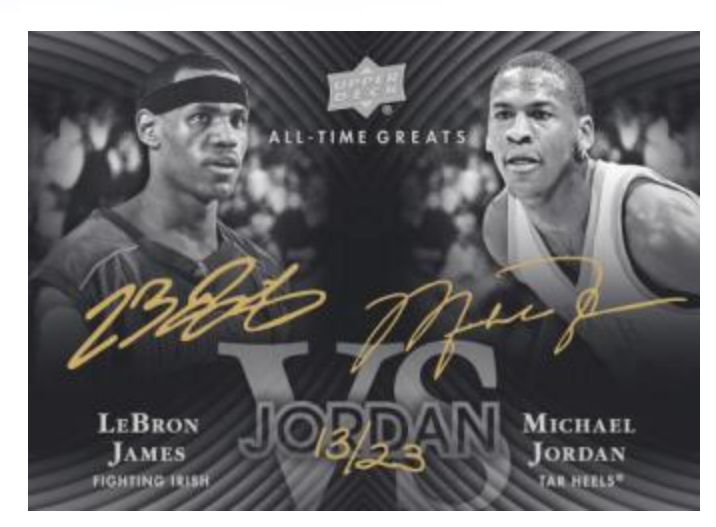
Jordan Vs. Dual Signature