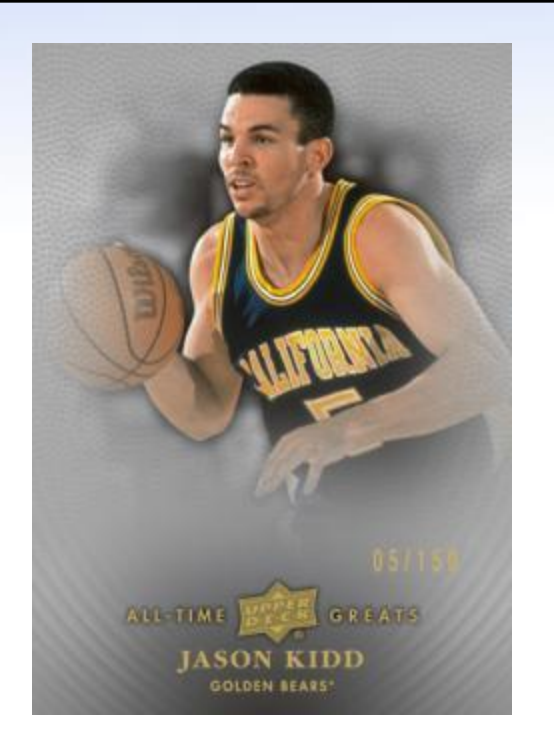
Regular Card Design