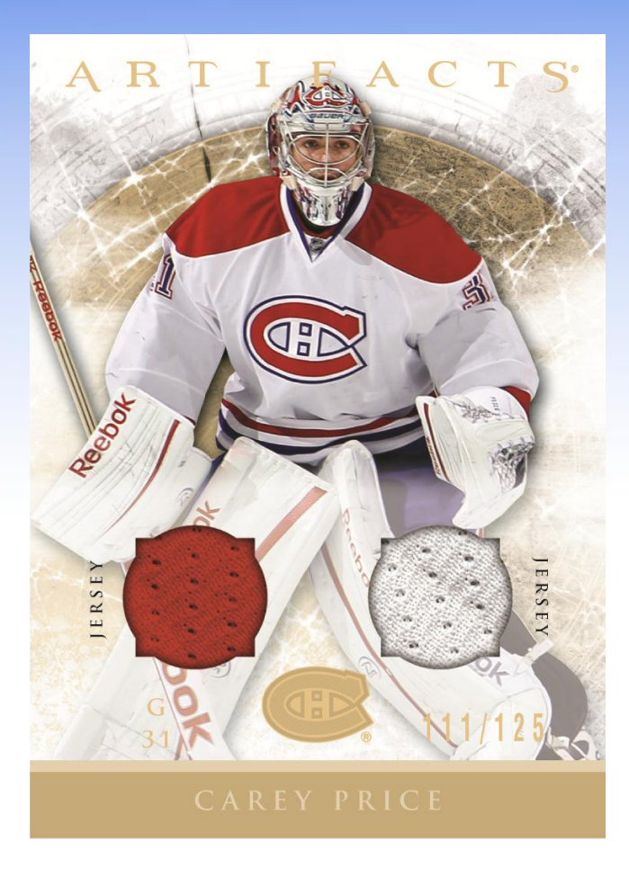
Regular Card, Memorabilia Variation