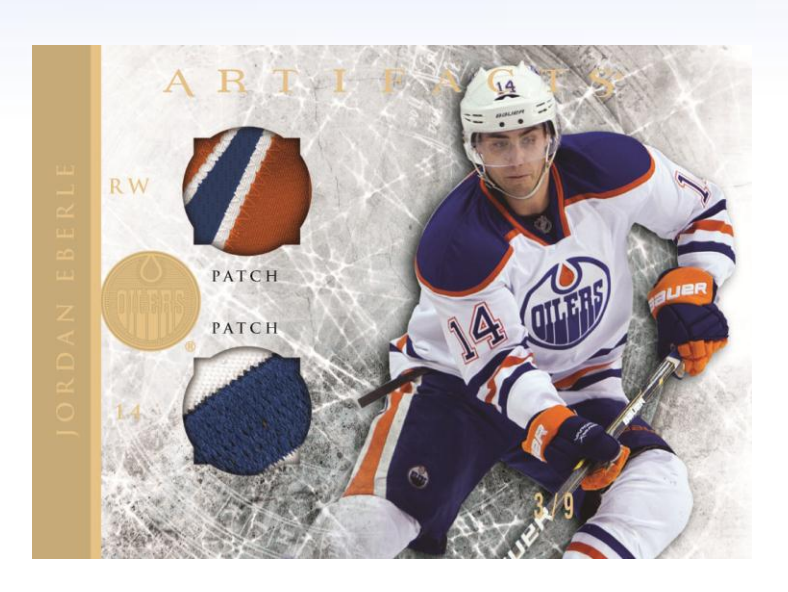
Horizontal Memorabilia Variation