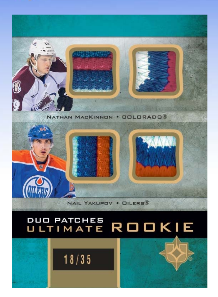
Ultimate Rookie Duo Patches