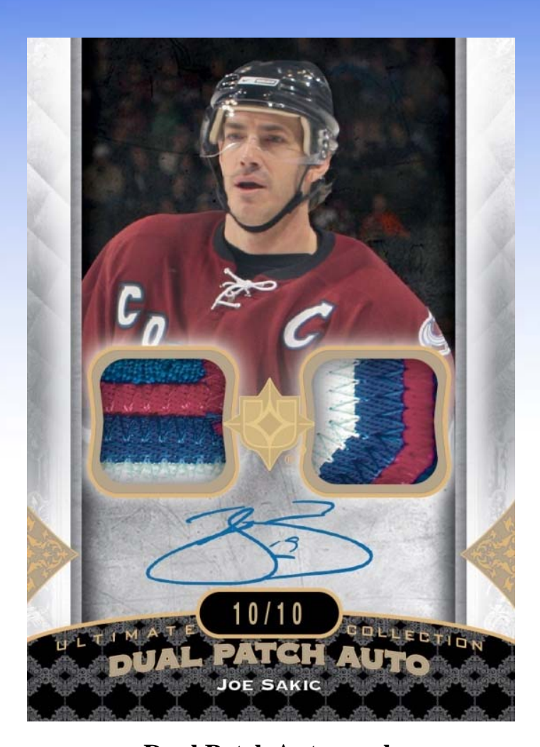
Dual Patch Autograph