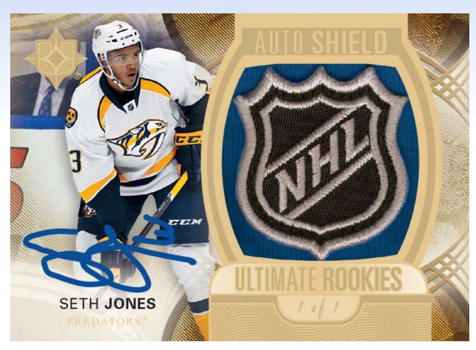
Ultimate Rookies -- Auto Shield Logo