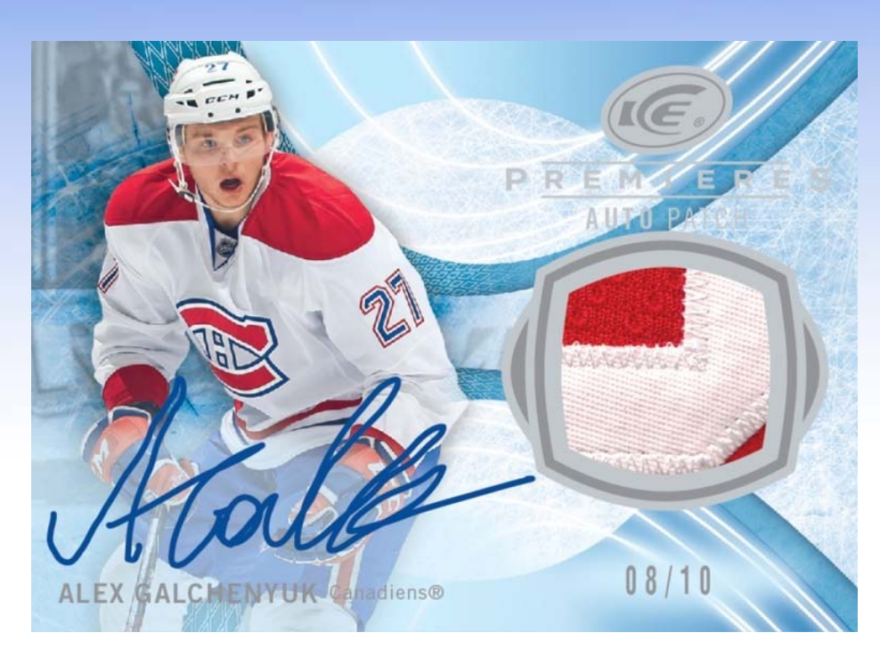
Ice Premiere Auto Patch