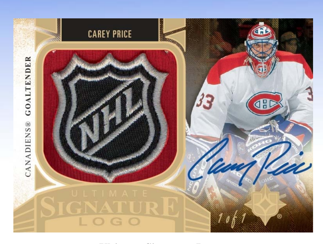
Ultimate Signature Logos