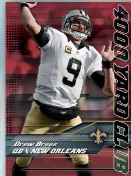
4,000 Yard Club-Red Refractor

INSERT CARDS INSERT CARDS INSERT CARDS INSERT CARDS INSERT CARDS