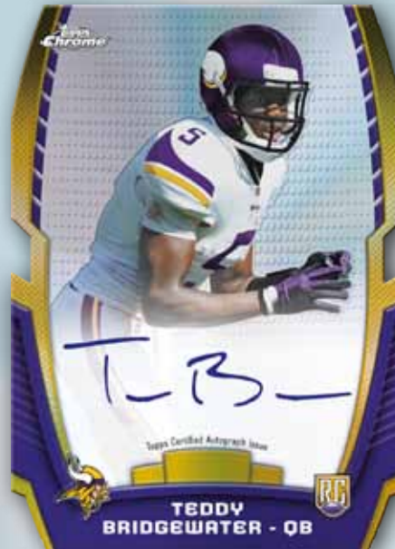
Chrome Rookie Die-Cut Refractor Autographed Card