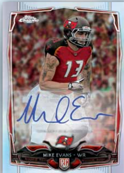
Mini Rookie Autographed Card