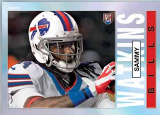
1985 Topps Football Refractor Card