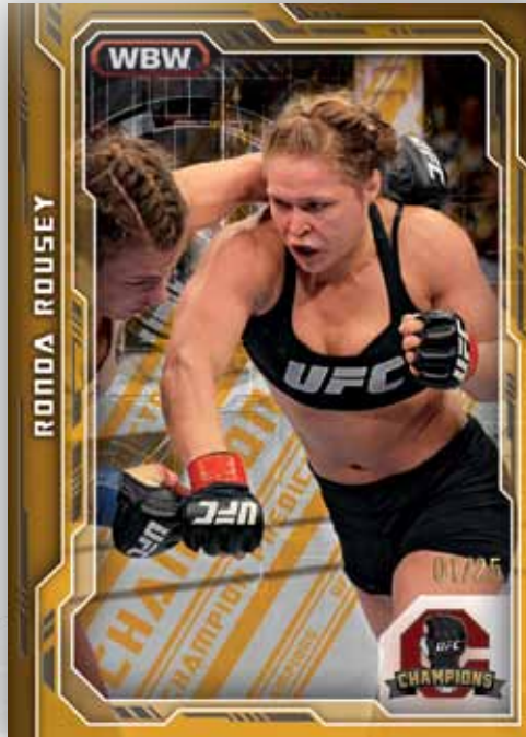
Base Card - Gold Champions Predictor Parallel