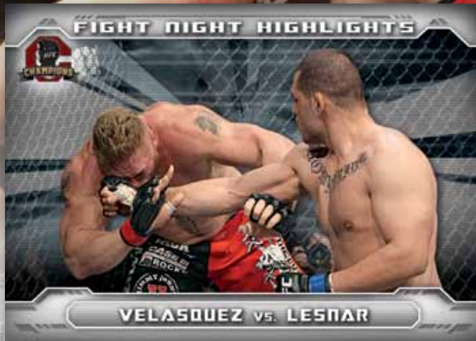
Fight Night Highlights

Fight Night Highlights – Submission, Knockout, and Fight of the Night winners grace these cards celebrating their amazing performances.