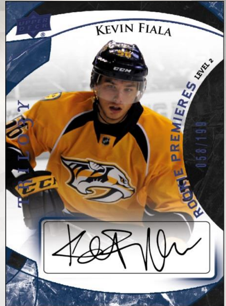
Uncommon Auto Rookie, Blue Parallel