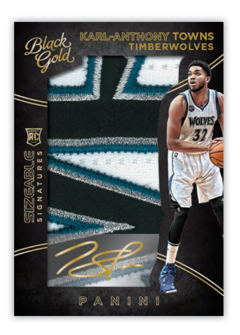
ROOKIE JERSEY AUTOGRAPHS PRIME