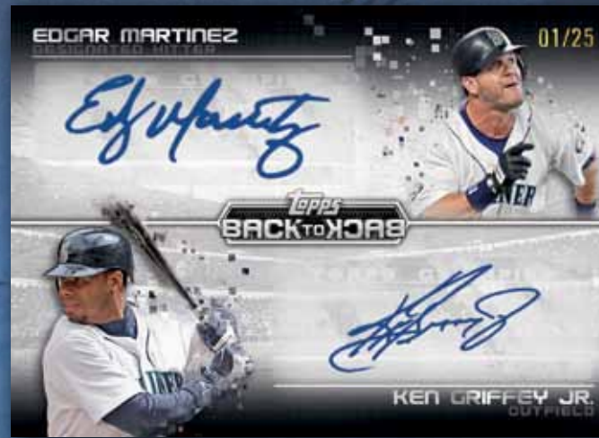
Back-To-Back Dual Autographs