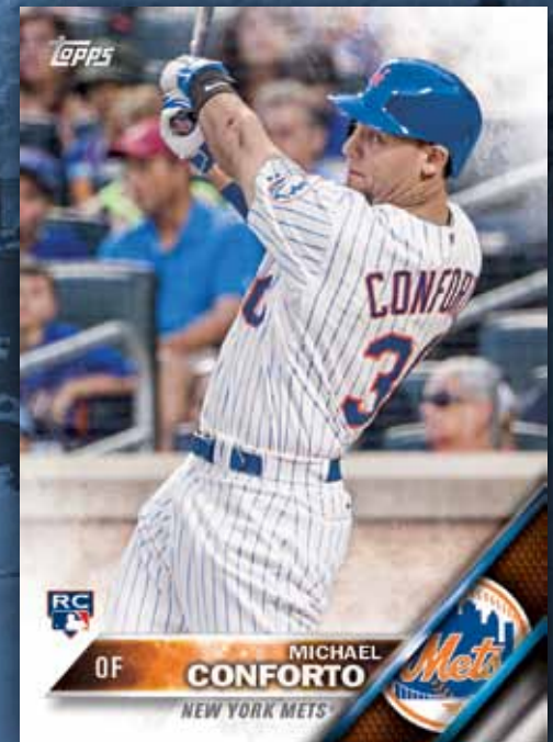
Rookie Base Card