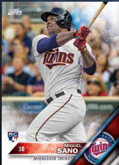
Rookie Base Card