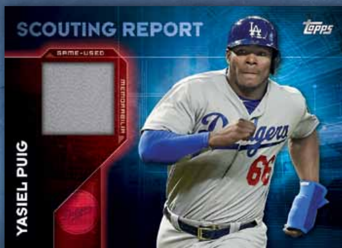
Scouting Report Relic