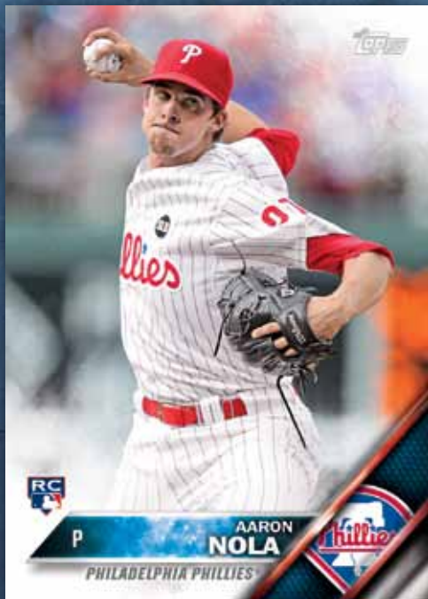
Rookie Base Card

350 action-packed base cards, featuring Veterans, Rookies, Future Stars, League Leaders, 2015 World Series ® Highlights, and Team cards.