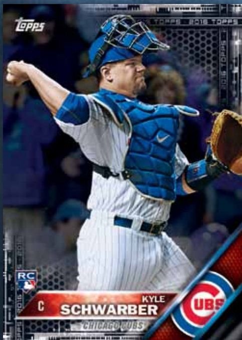
Rookie - Black Parallel