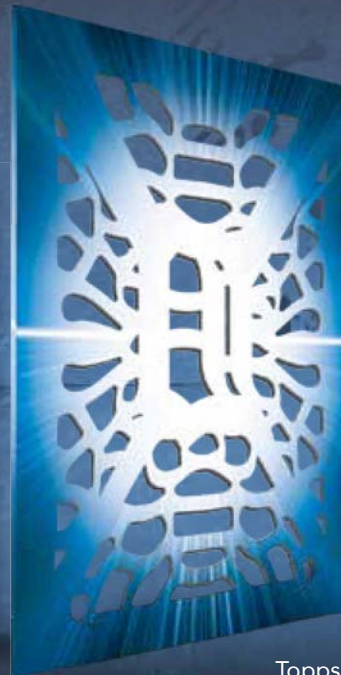
Topps Laser Insert