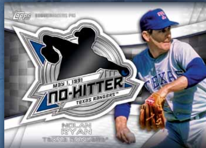
No-Hitter Pin Card