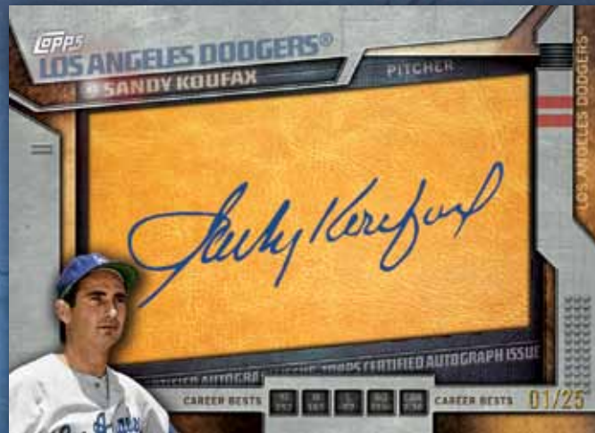
Glove Leather Autograph