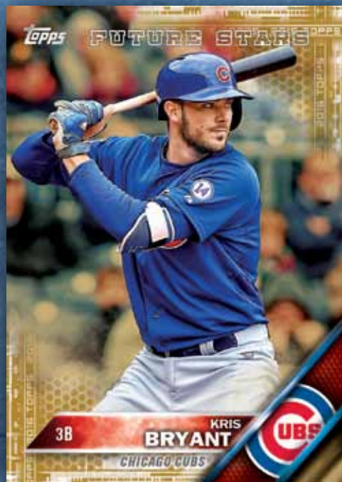
Future Stars - Gold Parallel

All 350 base cards will receive the following parallels: