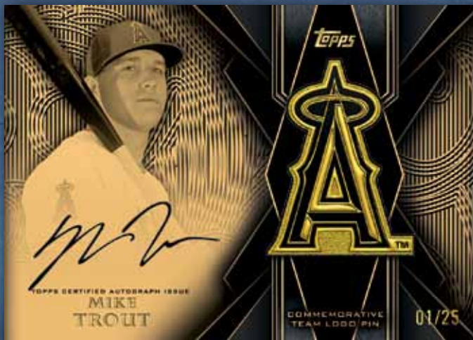
Team Logo Pin Autograph Card