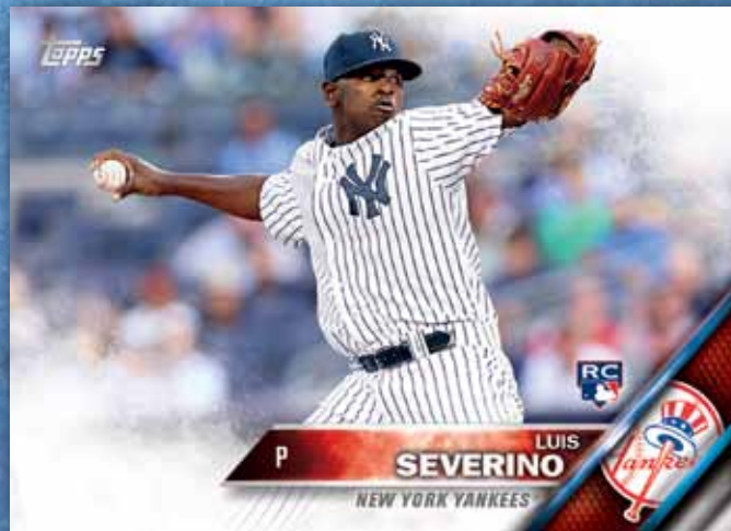
Rookie Base Card