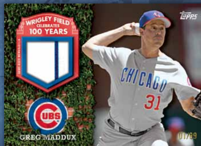
100 Years at Wrigley Field™ Relic