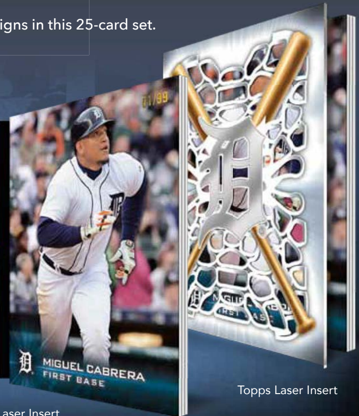
Topps Laser Insert