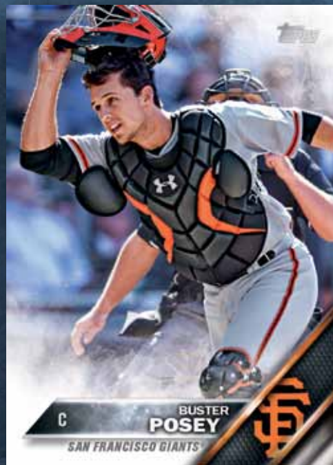
Veteran Base Card

The 350-card base set is back, featuring contemporary stars, future greats, and newly debuting rookies.