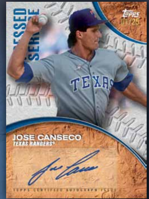
Pressed Into Service Autograph Card