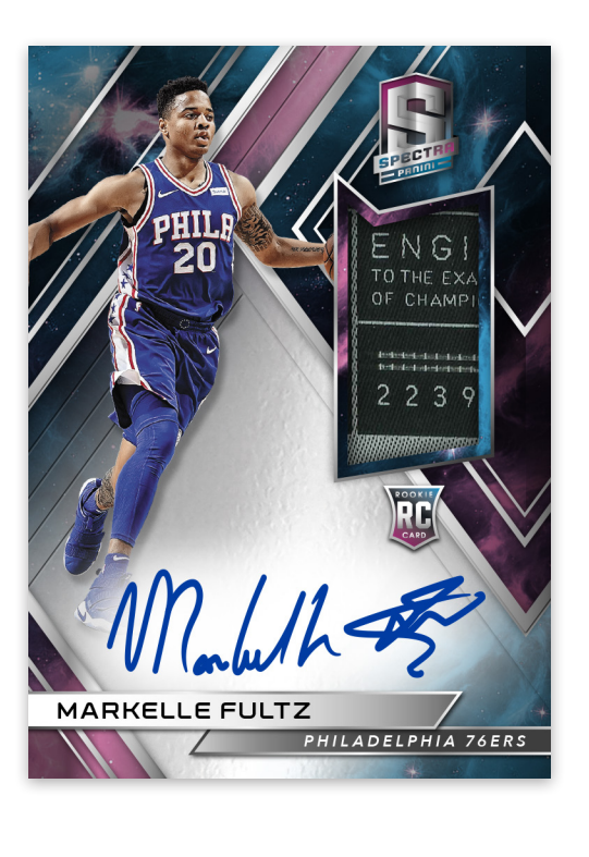
ROOKIE JERSEY AUTOGRAPHS NEBULA

Collect the 2017-18 rookie class with this on-card premium opti-chrome jersey autograph set! Every player boasts a base version #'d/299 with parallels down to 1-of-1s.