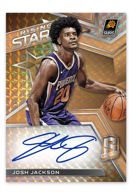
RISING STARS SIGNATURES NEON ORANGE