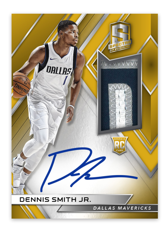
ROOKIE JERSEY AUTOGRAPHS GOLD