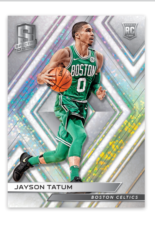
BASE WHITE SPARKLE

In years past, the rookies have only been available to collectors in the Rookie Jersey Autographs set but this year you will find them in the Base set with Silver(2 per case), White Sparkle(1 per case), and Nebula(#'d/1).