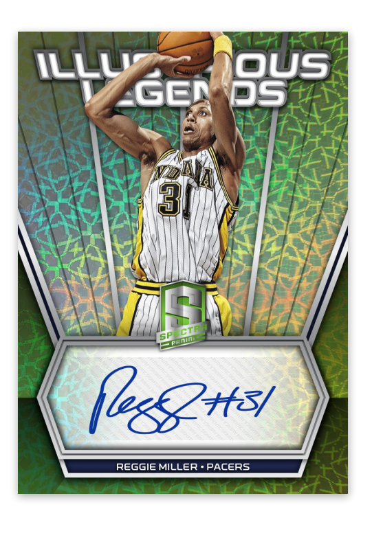
ILLUSTRIOUS LEGENDS SIGNATURES NEON GREEN

Spectra contains some of the flashiest autographs on the market. In The Zone, Rising Stars, and Illustrious Legends all have a plethora of parallels to chase on premium opti-chrome technology!