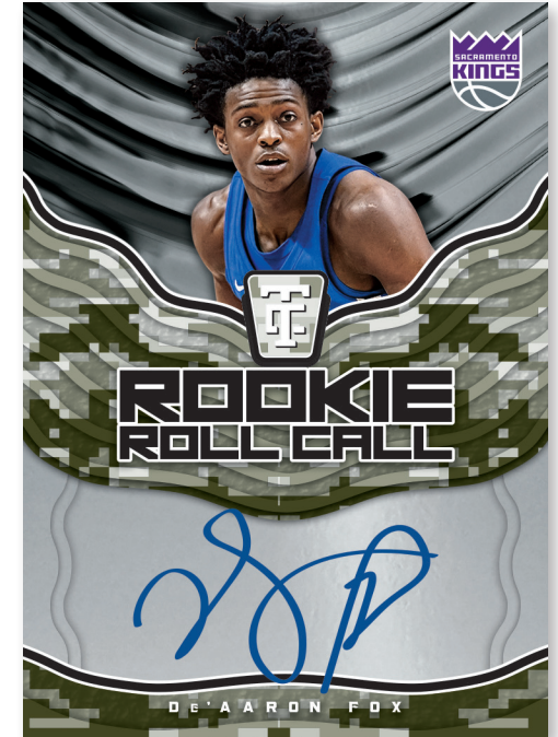
ROOKIE ROLL CALL CAMO

Look for stunning on-card autographs from the best and brightest stars of the 2017 NBA Draft Class.