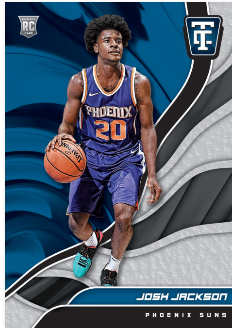
BASE ROOKIES HOLO BLUE