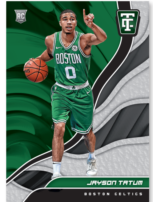
BASE ROOKIES GREEN

Chase down stunning Base and Base Rookies parallels, numbered as low as one-of-one!