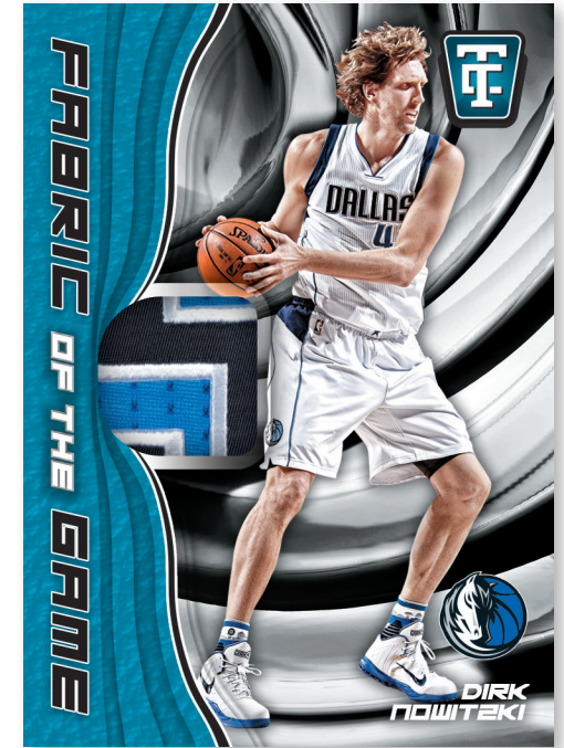
FABRIC OF THE GAME HOLO BLUE

Chase the new 2017 insert, featuring an eye-catching spray-paint design.