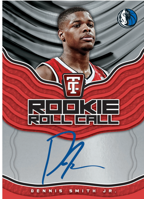
ROOKIE ROLL CALL RED