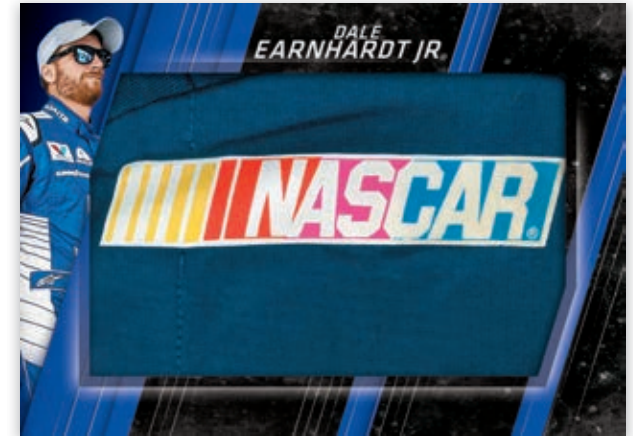
ABSOLUTE PRIME NASCAR

These rare patches are numbered to 2 or less. Included in these patches are Name Plates, NASCAR Bar, Monster Energy Series Patch, Associate Sponsors and more.