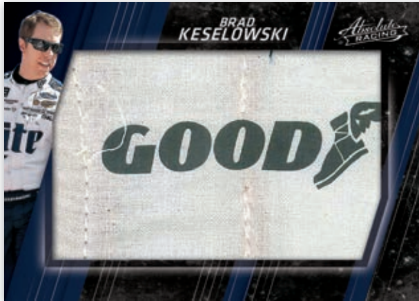
ABSOLUTE PRIME GOODYEAR