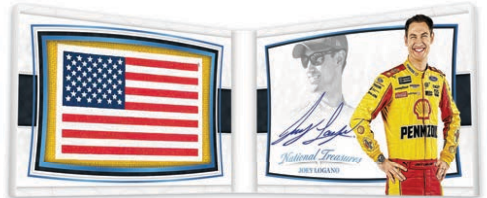
BOOKLET - FLAG PATCH SIGNATURE