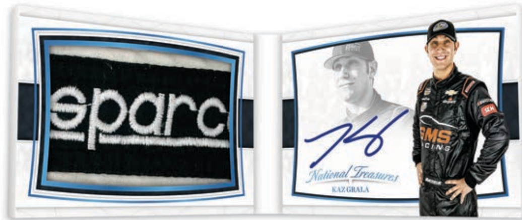
BOOKLET - ASSOCIATE SPONSOR SIGNATURE

Look for signed booklets that feature unique firesuit patches #*d/ 2 or less.