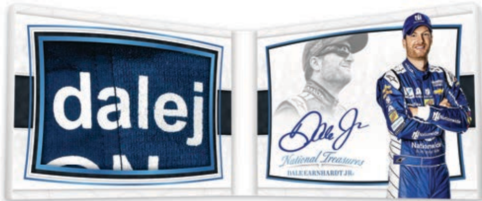
BOOKLET - NAMEPLATE PATCH SIGNATURE