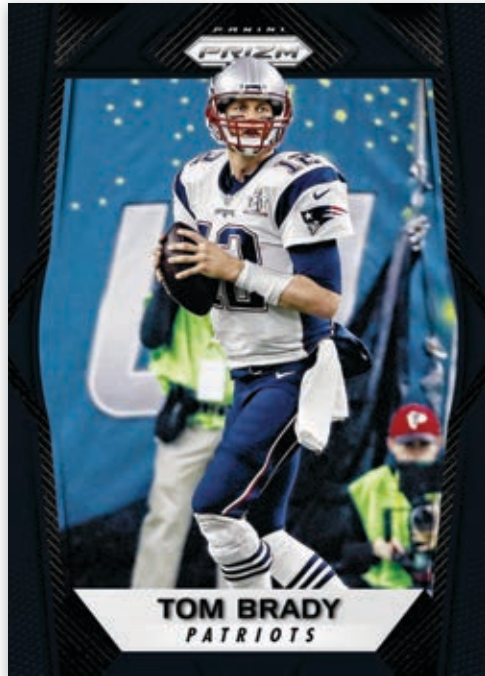
BASE BLACK FINITE