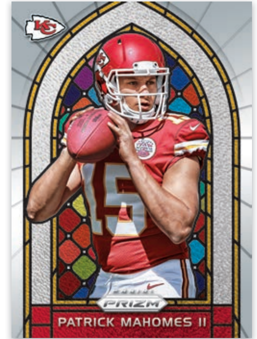
STAINED GLASS PRIZM

Look for stunning new inserts featuring the league's best past, present and future superstars! Chase rare Gold Mojo and Black Finite parallels!