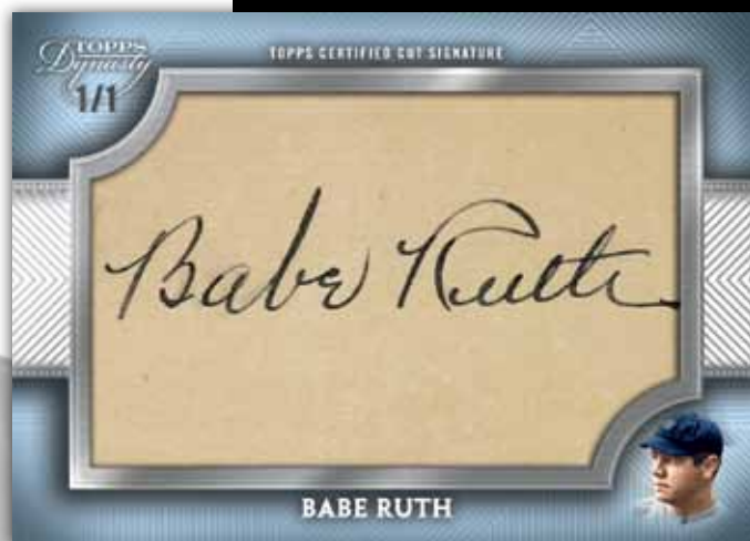
Cut Signature Card