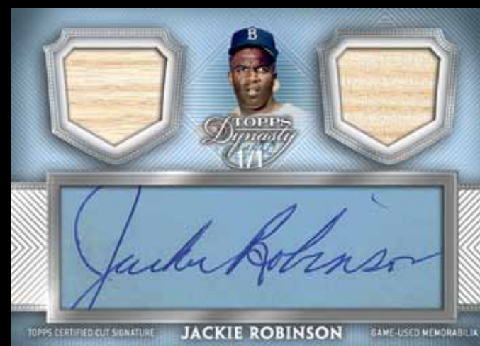
Dual Relic Cut Signature Card