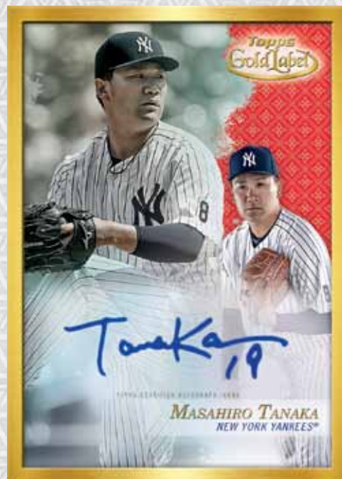
Framed Autograph Card - Red Parallel

MAKE YOUR PURCHASE FOR 2017 TOPPS GOLD LABEL TODAY PRODUCT AVAILABLE IN SEPTEMBER 2017