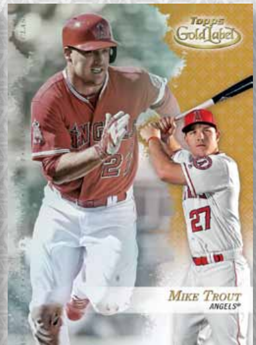
Class 3 Card - Gold Parallel