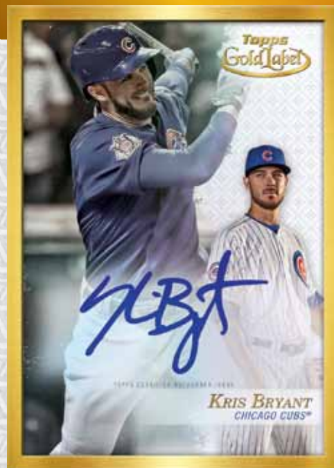
Framed Autograph Card