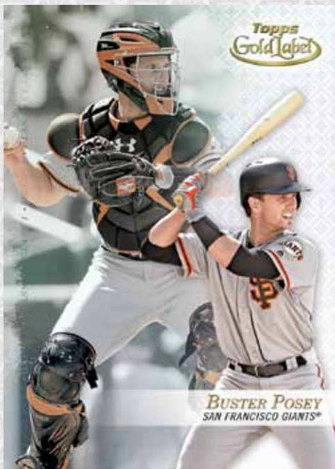
Class 1 Card

Class 1 – 1/1 Class 2 – 1/1 Class 3 – 1/1