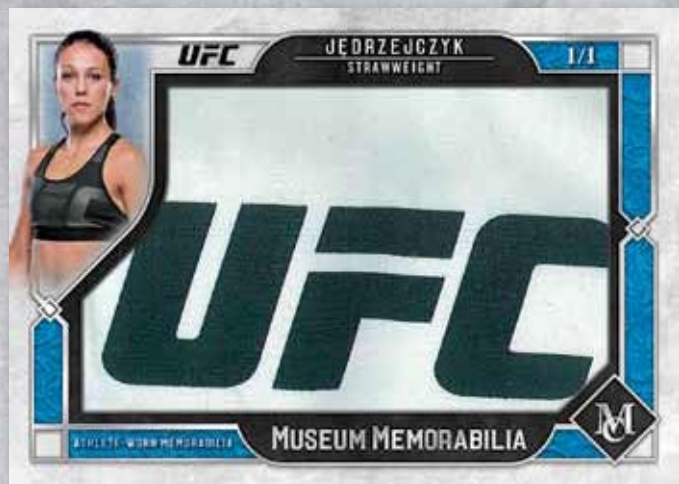
Museum Memorabilia Card