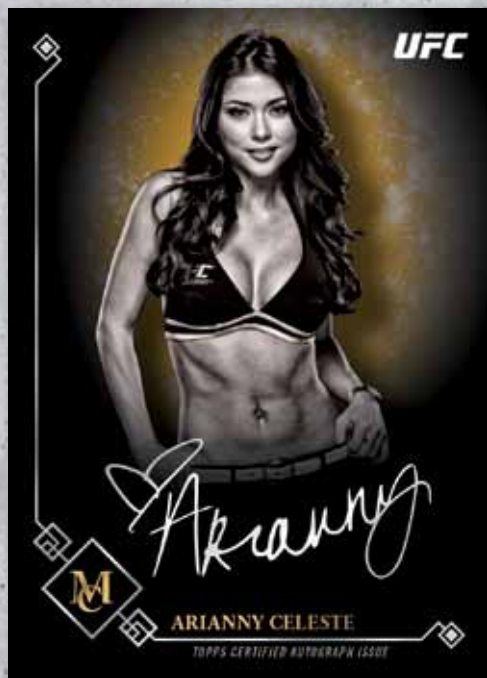
Museum Autograph Card - Gold Parallel