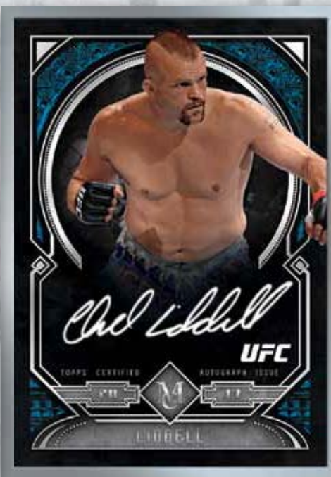
Museum Collection Autograph Card - Silver Framed Parallel

NEW! Museum Autographs – A premier checklist of UFC athletes showcasing current, retired and newly debuting fighters. Autographs will be signed on the card! Base version will be numbered to 99 or less.