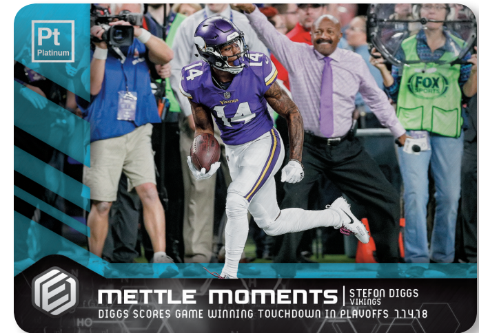
METTLE MOMENTS PLATINUM

Metal base cards highlights only the best the NFL has to offer chase photo variations with Home, Away, Throwback, and Color Rush photos.