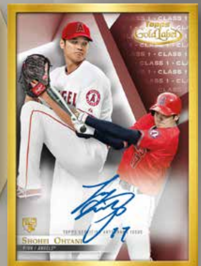
Framed Autograph Card - Red Parallel

MAKE YOUR PURCHASE FOR 2018 TOPPS GOLD LABEL TODAY PRODUCT AVAILABLE IN SEPTEMBER 2018