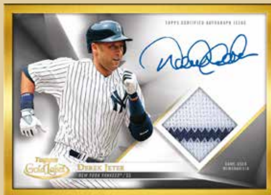
Golden Greats Framed Autograph Relic Card