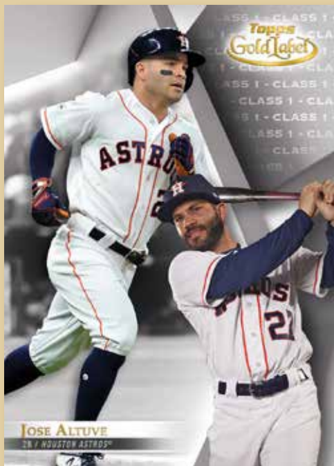
Class 1 Card

Class 1 – #'d 1/1 Class 2 – #'d 1/1 Class 3 – #'d 1/1