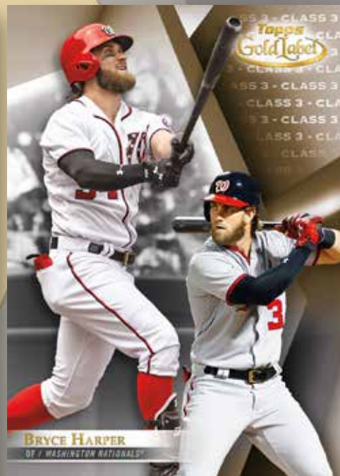
Class 3 Card - Gold Parallel