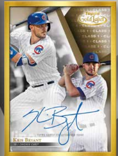
Framed Autograph Card