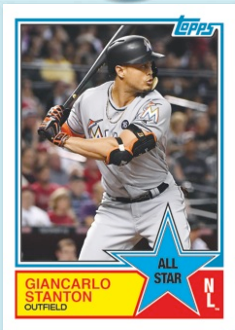
1983 Topps Baseball All-Star Card