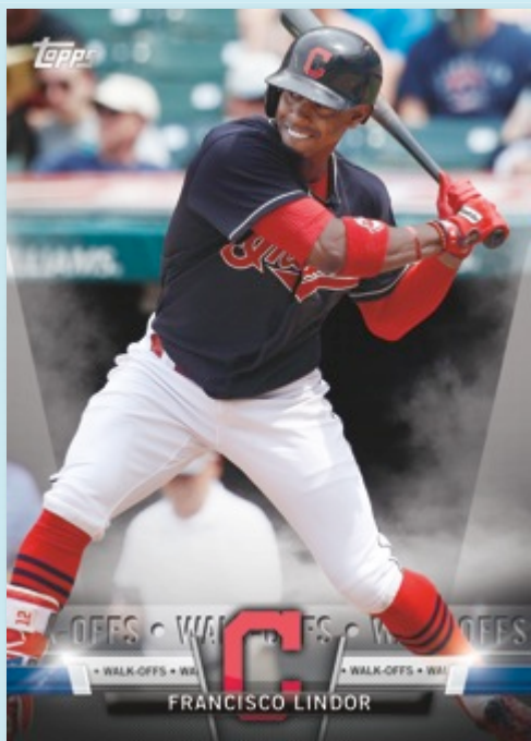
Topps Salute – Walk-Offs