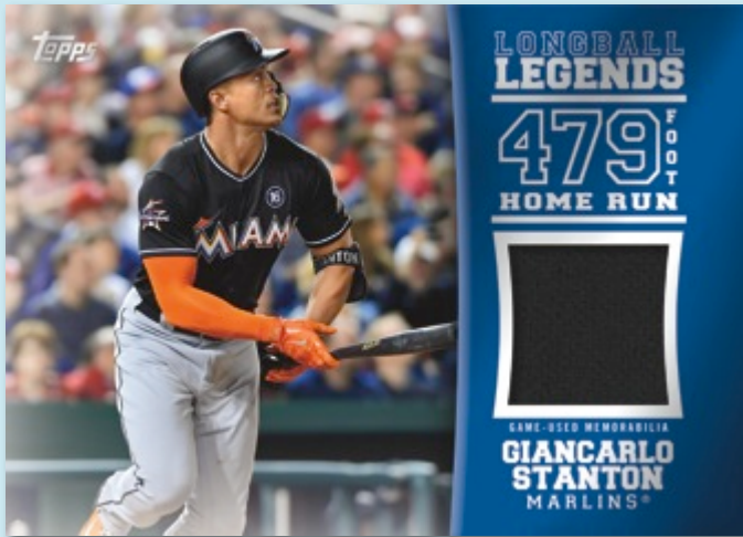
Longball Legends Relic Card