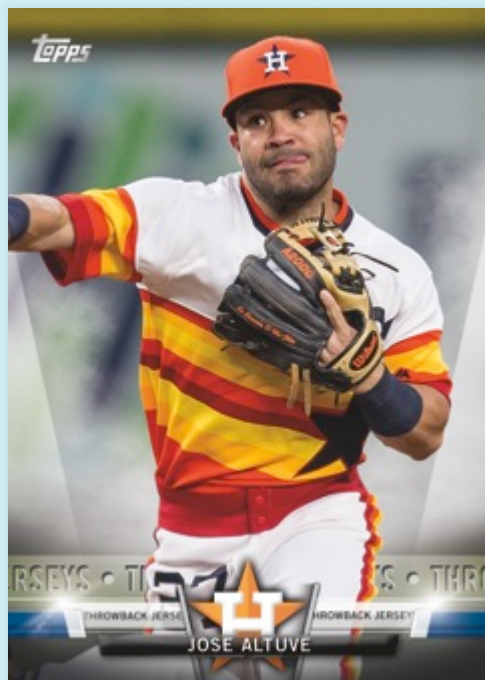
Topps Salute – Throwback Jerseys