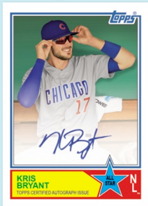
1983 Topps Baseball All-Star Autograph Card