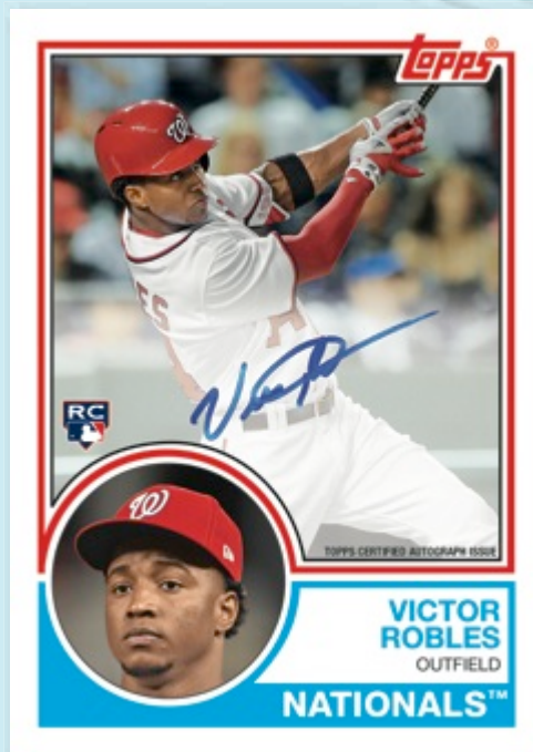
1983 Topps Baseball Rookie Autograph Card