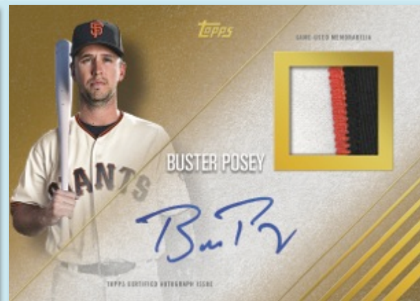
Topps Reverence Autograph Patch Card