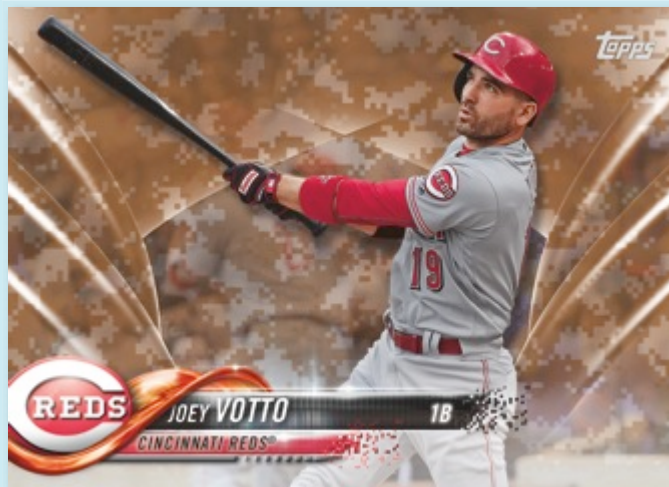
Base Card – Memorial Day Parallel