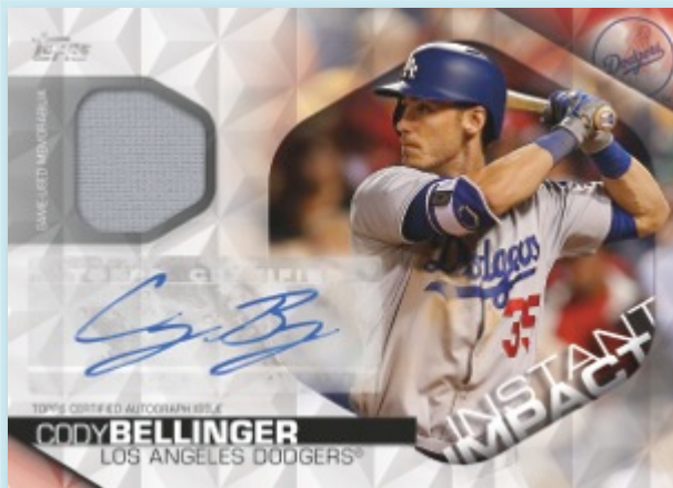
Instant Impact Autograph Relic Card