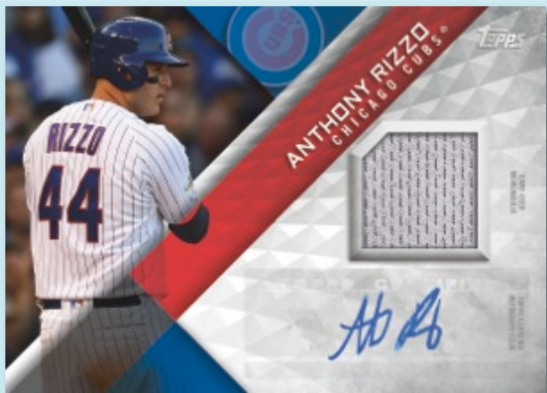
Major League™ Material Autograph Card