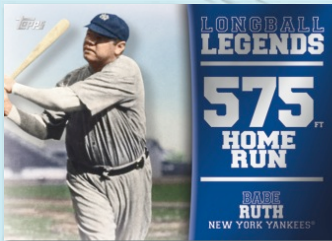
Longball Legends Card