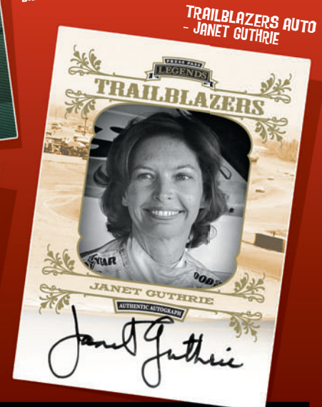
TRAILBLAZERS AUTO - JANET GUTHRIE

SET CONTENT, DESIGN & ROSTER SUBJECT TO CHANGE