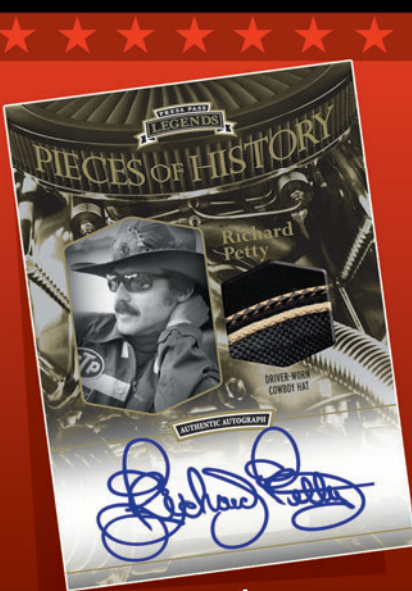
PIECES OF HISTORY - RICHARD PETTY

EACH SIX-PACK MINI BOX FEATURES AN AUTOGRAPH AND A MEMORABILIA CARD FROM A RACING LEGEND INCLUDING: