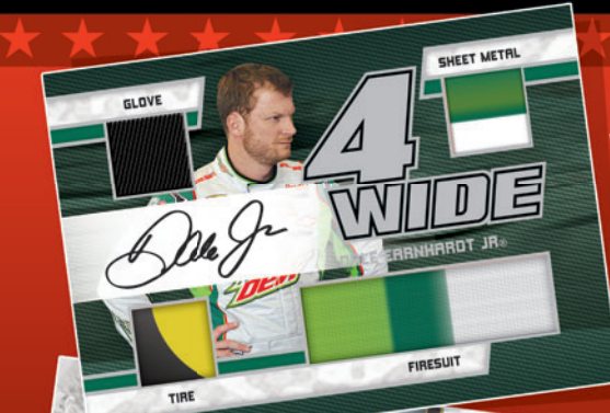
FOUR WIDE SIGNATURE EDITION - DALE EARNHARDT JR.