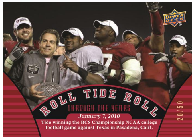
Roll Tide Through the Years