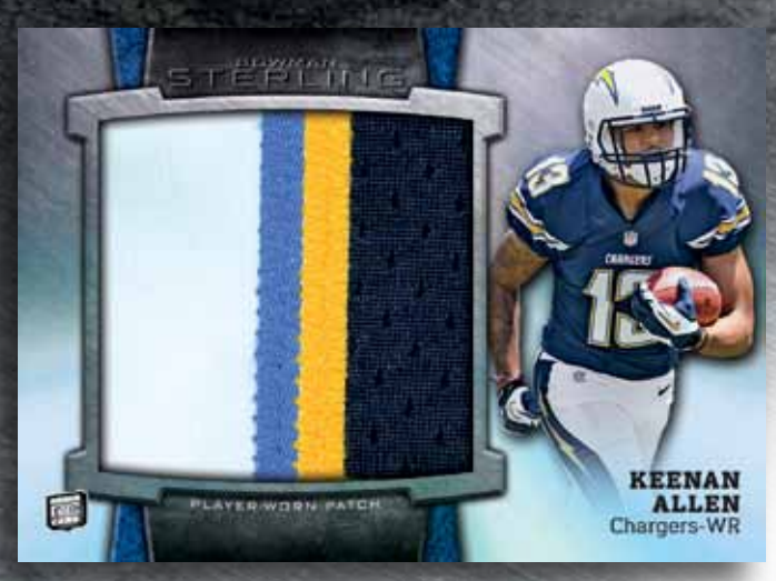
Jumbo Rookie Patch Card - Box Topper