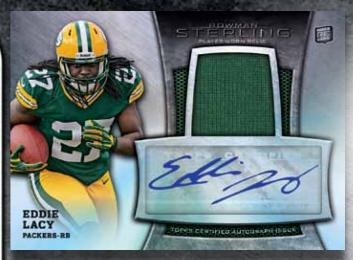
Autographed Rookie Relic Card