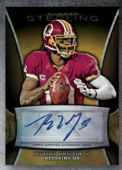
Autograph Card - Gold Refractor Parallel