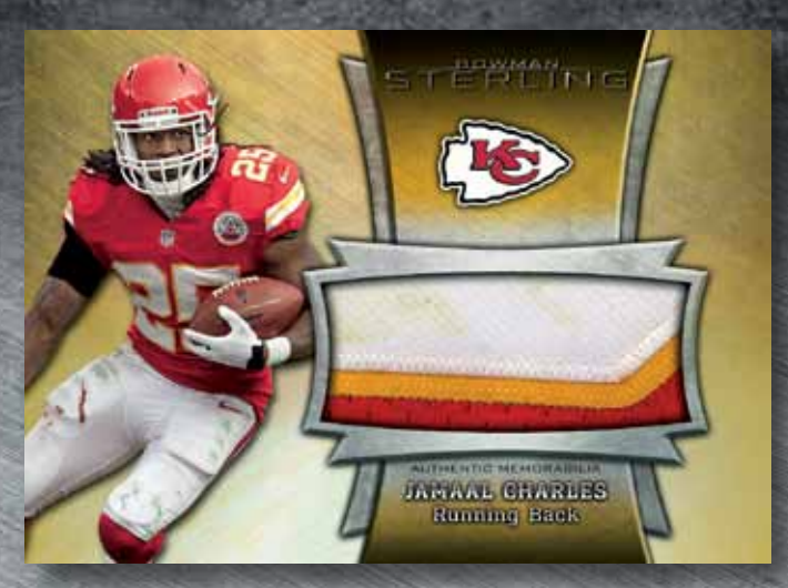
Jumbo Veteran Relic Card - Gold Refractor PATCH Parallel