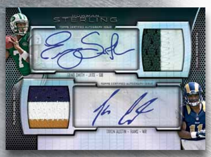
Prism Refractor Dual Autographed Dual Relic Card