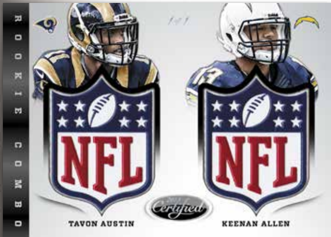
Nothing compares to the NFL Shield. These 1-of-1 combo shields are some of the most sought after cards for the 2013 rookies.