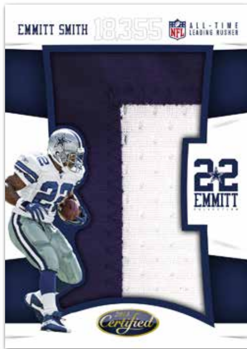
The NFL's all-time leading rusher, Emmitt Smith became a household name with America's Team in the 1990s. This five-card insert showcases his best highlights and also comes with an autographed memorabilia version.