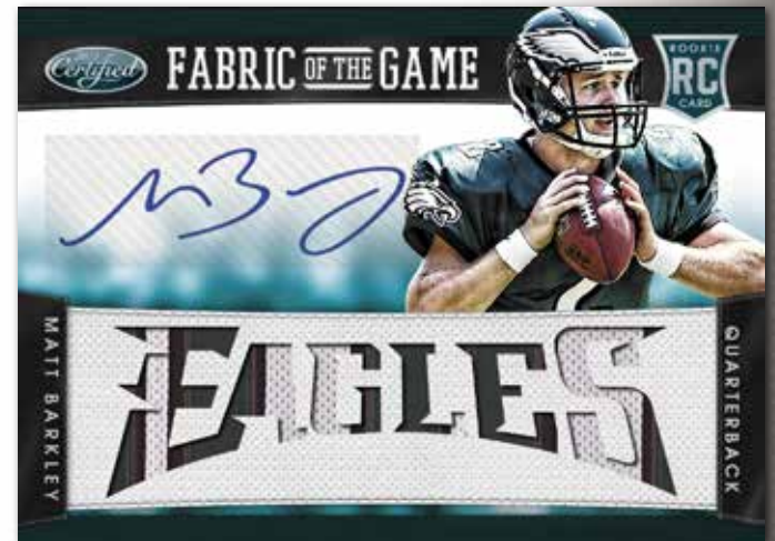
A staple in Certified, these iconic team name die-cuts feature the best and brightest rookies from this year's class.