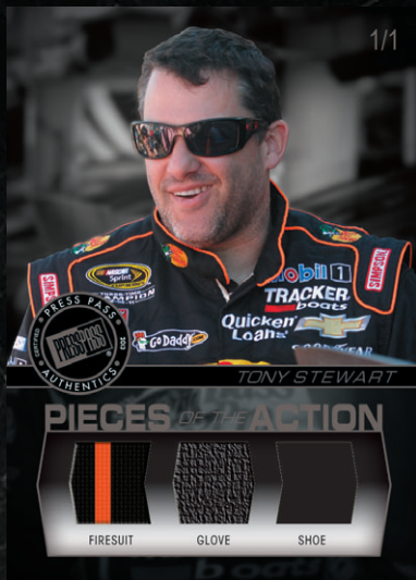
Tony Stewart PIECES OF THE ACTION