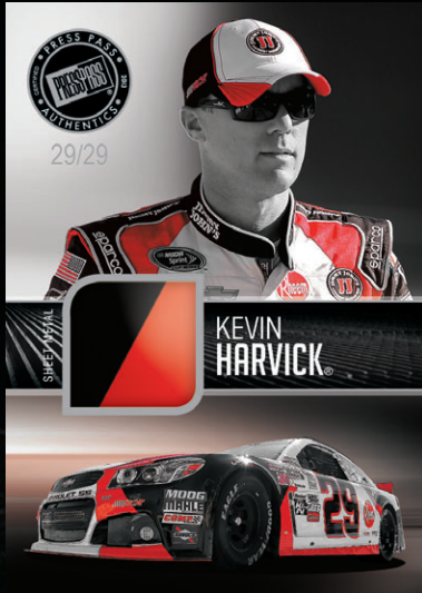
Kevin Harvick® REDLINE RELICS