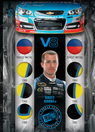
Kasey Kahne® V8