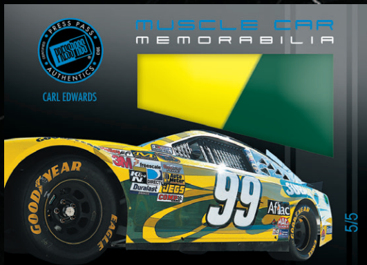
Carl Edwards MUSCLE CAR MEMORABILIA