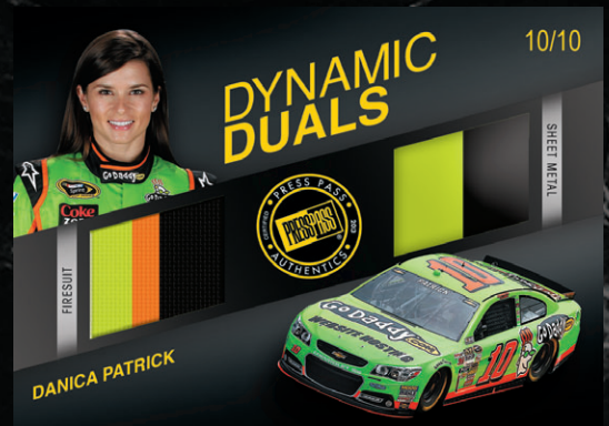
Danica Patrick DYNAMIC DUALS