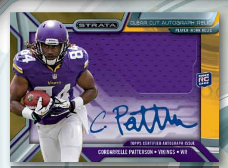
Clear Cut Autographed Relic Rookie Card - Gold Parallel