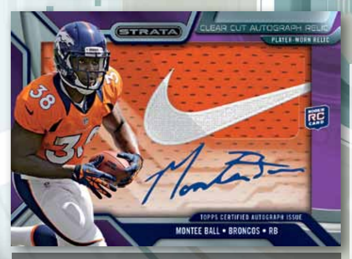
Clear Cut Autographed Relic Rookie Card - Swoosh Parallel