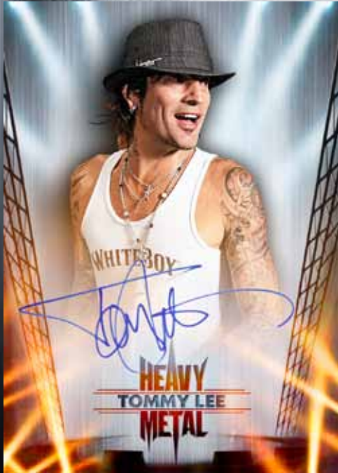
Heavy Metal Autograph Card