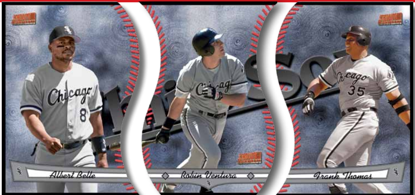
1998 Stadium Club Triumvirate Illuminator Cards

Collect all 3 players from each team to complete the Triumvirate