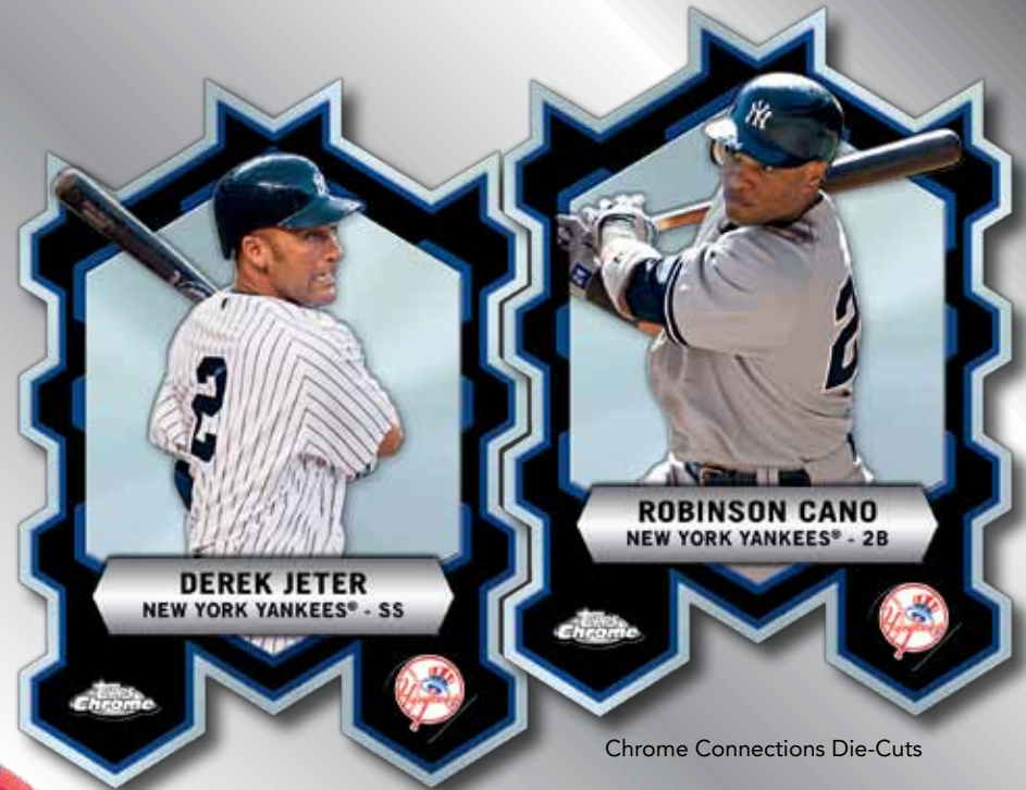
Chrome Connections Die-Cuts