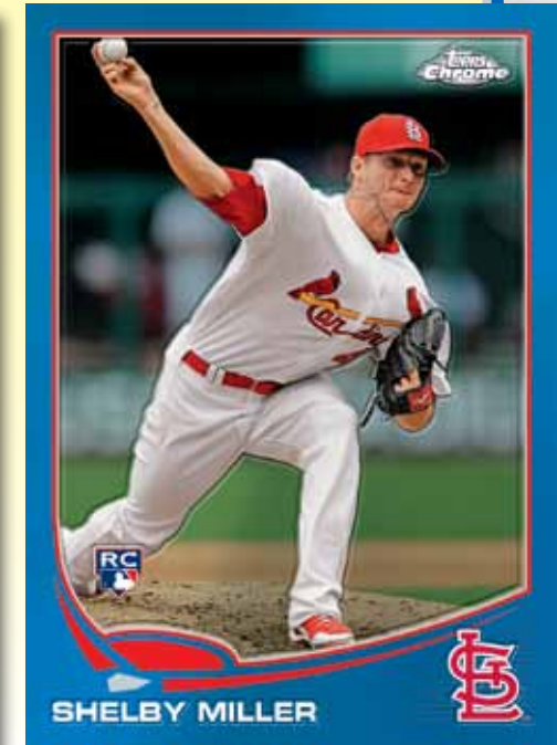
Base Blue Refractor Card