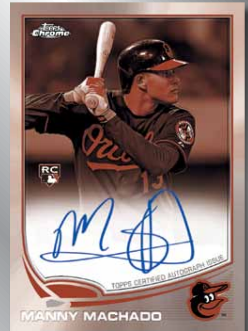
Autographed Rookie Sepia Refractor Card