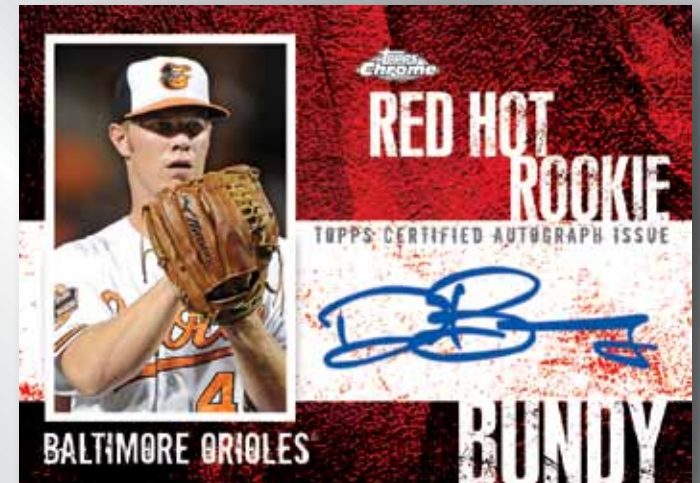
Red-Hot Rookies Autographed Card