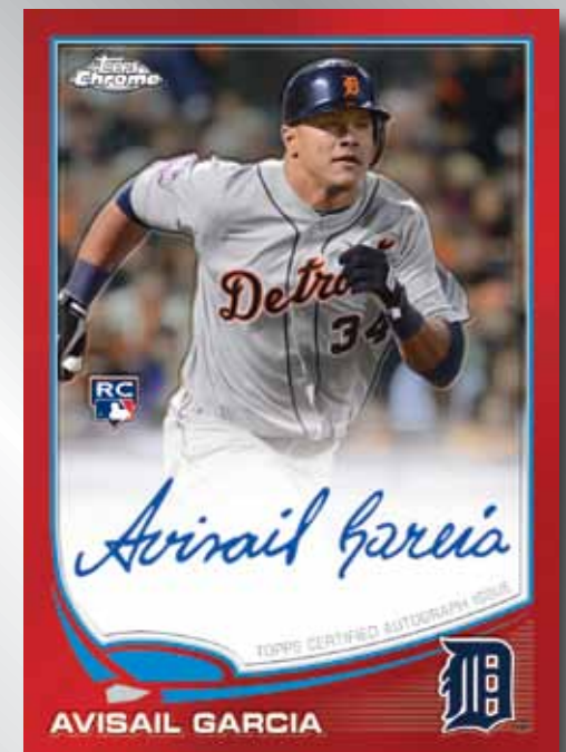
Autographed Rookie Red Refractor Card