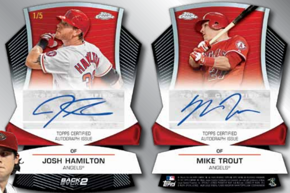
Back-To-Back Die-Cut Autographed Card

Ultimate Chase Cards Continuing the theme from Topps Baseball Series 1 & Series 2. NEW!