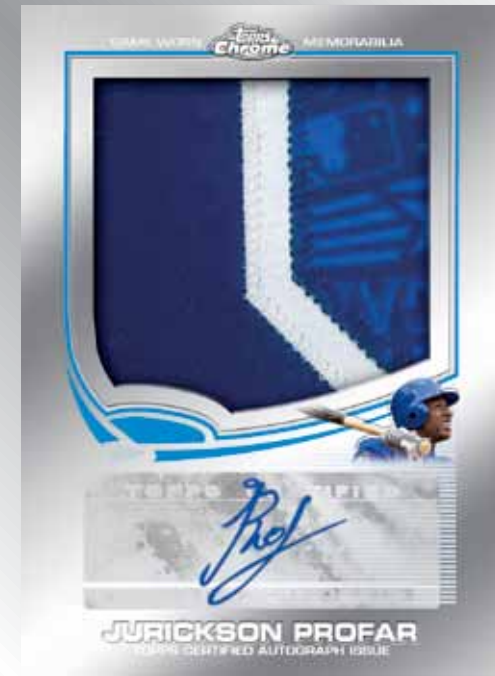
Autographed Patch Variation Card