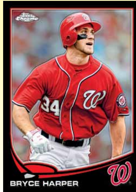
Base Black Refractor Card

Printing Plates numbered 1/1. Hobby Only