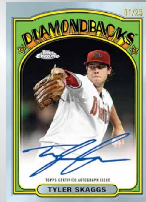
1972 Topps Chrome Autographed Card