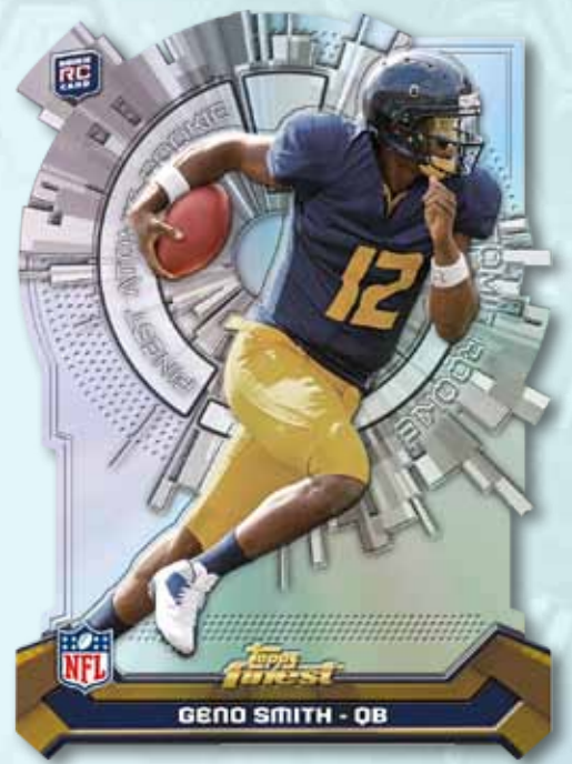
Finest Atomic Refractor Rookie Insert Card

Mystery Rookie Autograph Redemption (1 subject): Autographed Rookie card of a TBD player, announced during the 2013 season. Limited