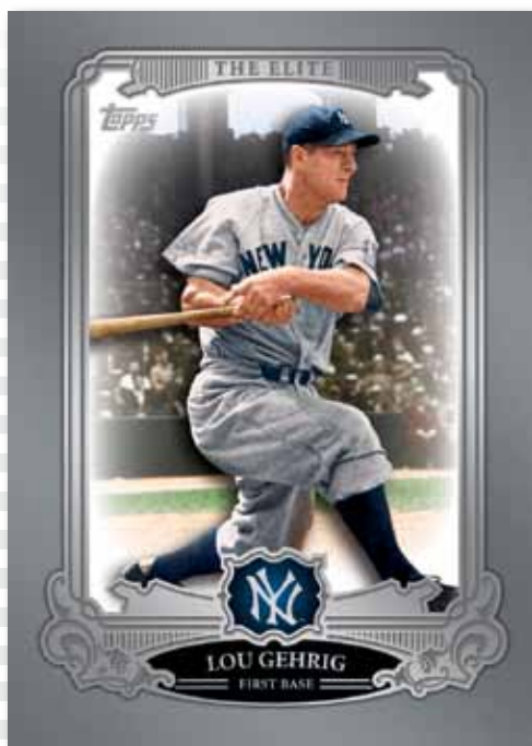
The Elite Card