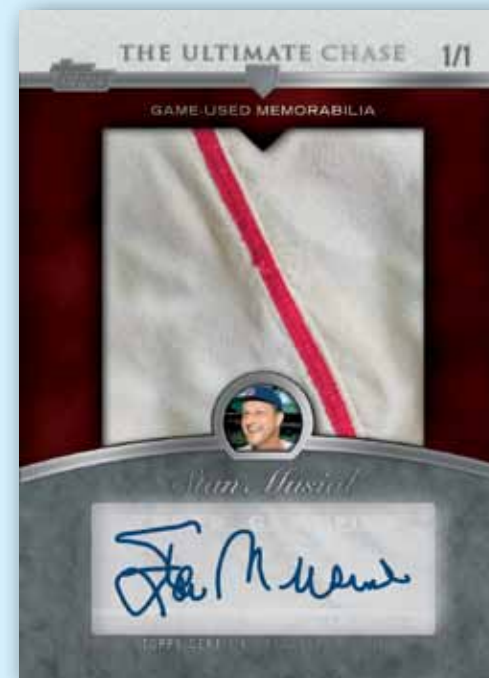
The Ultimate Chase 1/1 Autographed Relic Card

The Ultimate Chase Cards —20 more individually designed and constructed cards will feature some of the biggest active and retired stars, with an autograph and a unique relic, or a cut signature and a unique relic.