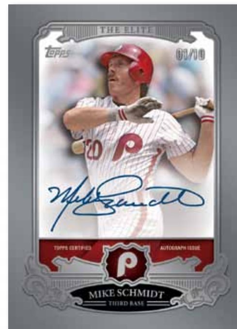
The Elite Autograph Card