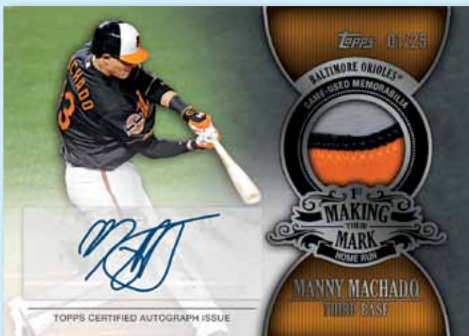
Making Their Mark Autograph Relic Card