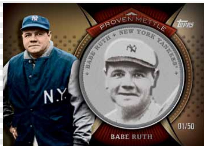
Proven Mettle Wrought Iron Card

MVP Award Winners – 10 cards featuring MVP winners with a commemorative MVP trophy embedded in the card.