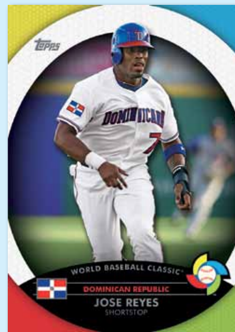
World Baseball Classic™ Stars Card

1972 TOPPS MINIS: 50 more mini cards featuring the 1972 Topps design.