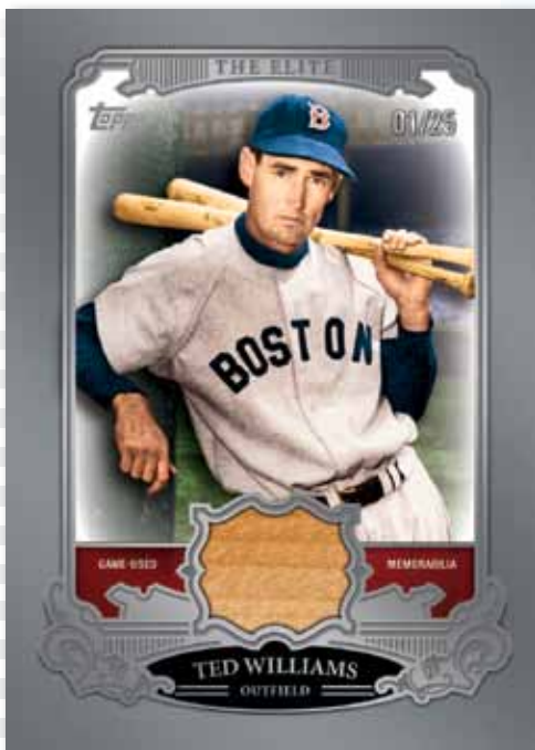
The Elite Relic Card