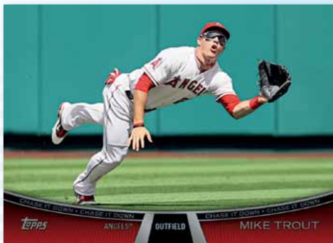
Chase It Down Card