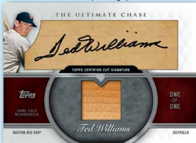
The Ultimate Chase Cut Signature Relic Card