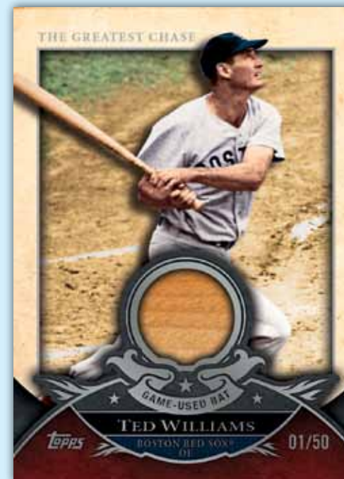
The Greatest Chase Relic Card

THE ELITE RELICS: 10 subjects. Sequentially numbered to 25.