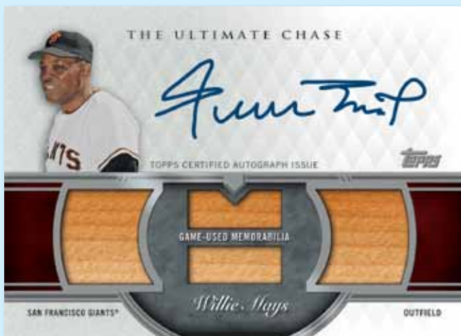
The Ultimate Chase Triple Autographed Relic Card