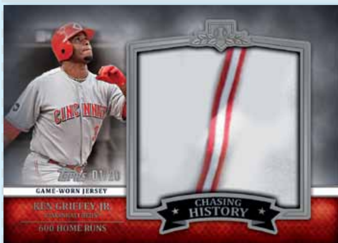
Chasing History Relic Card

THE GREATEST CHASE CUT SIGNATURE RELIC CARD: Celebrating Ted Williams' successful chase for a .400 season and featuring a piece of game-used memorabilia and a cut signature. Sequentially numbered to 5.