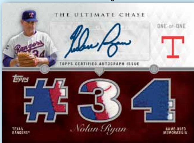
The Ultimate Chase Autographed Triple Relic Card

The Ultimate Chase Cards —20 more individually designed and constructed cards will feature some of the biggest active and retired stars, with an autograph and a unique relic, or a cut signature and a unique relic.