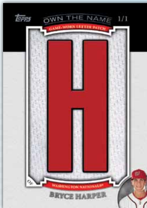
Own the Name Patch Card