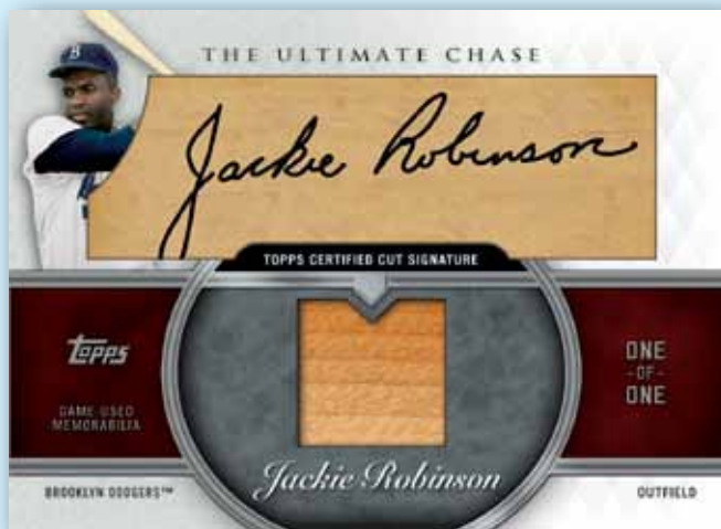
The Ultimate Chase Cut Signature Relic Card