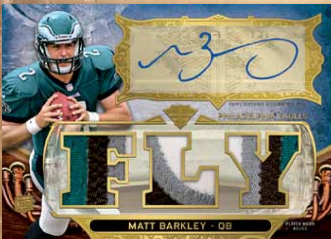
Triple Threads Autograph Relic Card - Sapphire Parallel