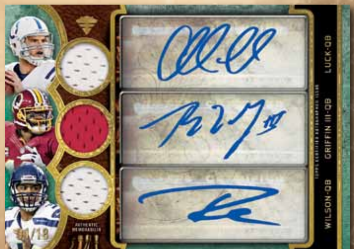
Triple Threads Autograph Relic Trio Card