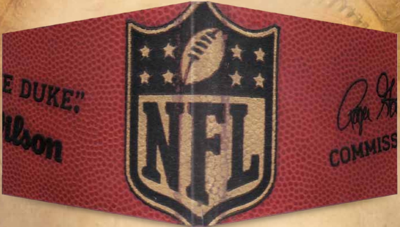
Leather-Bound Autograph Relic Book Card OUTSIDE