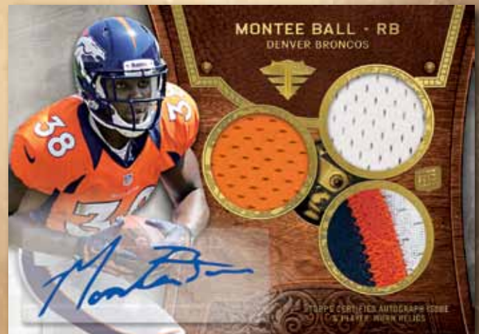
Base Rookie Autograph Relic Card