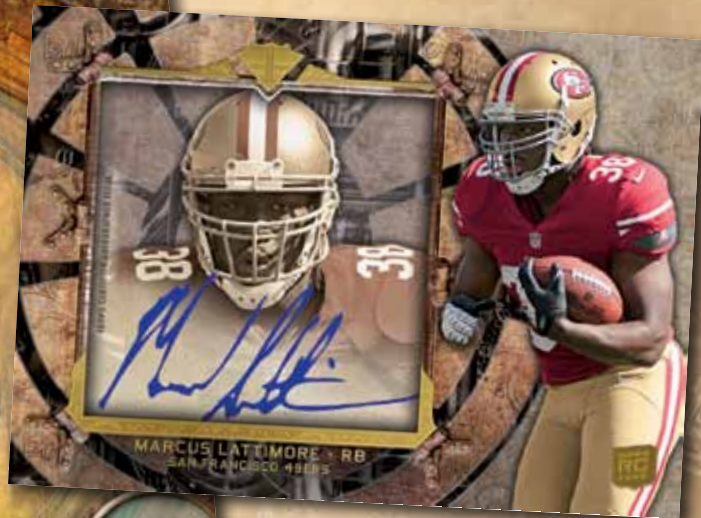
Triple Threads Transparency Card