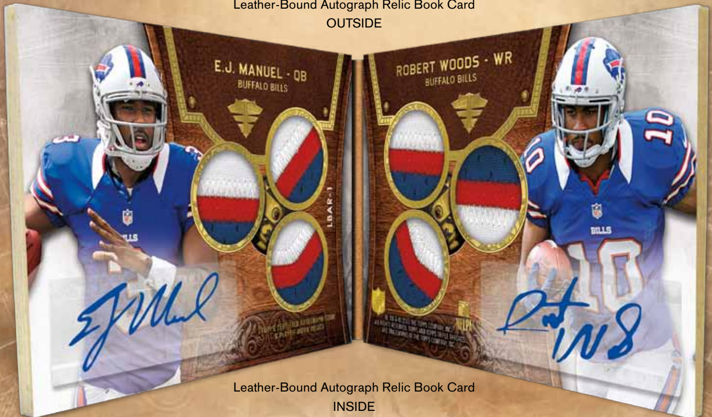
Leather-Bound Autograph Relic Book Card INSIDE