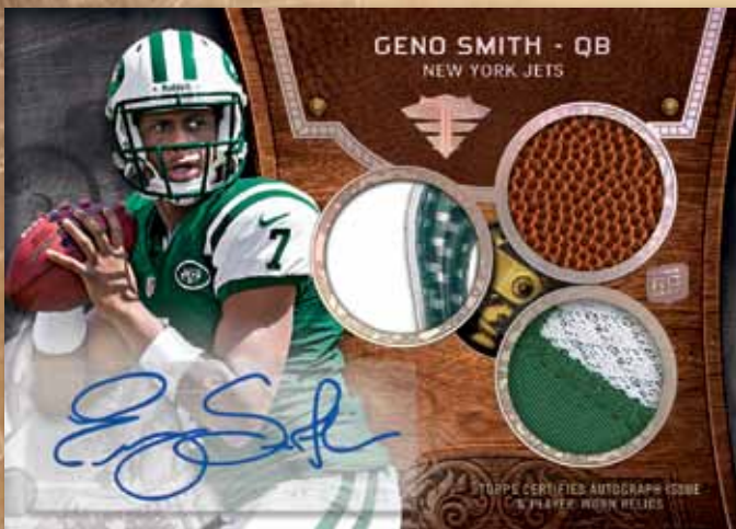
Base Rookie Autograph Relic Card - Onyx Silver Rainbow Foil Parallel