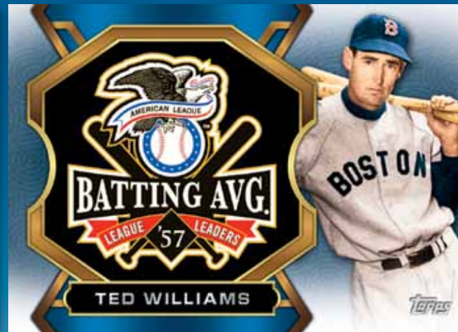
League Leader Pin Card