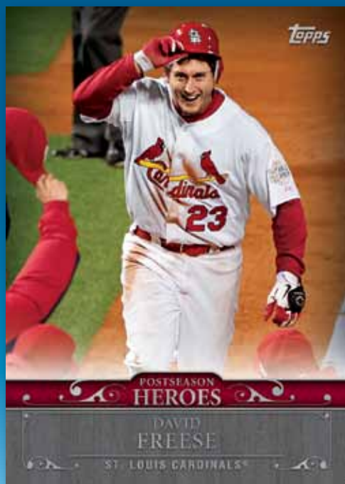
Postseason Heroes Card

Franchise Forerunners – 20 dual-subject cards pairing current Rookies with one of their franchise's most famous Rookies from the past.