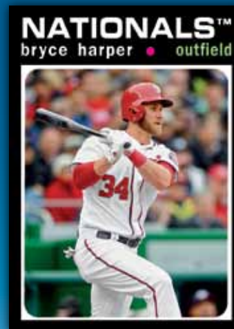
1971 Topps Mini Card