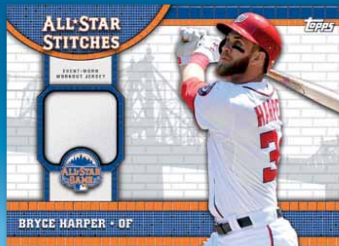
All-Star Stitches Card