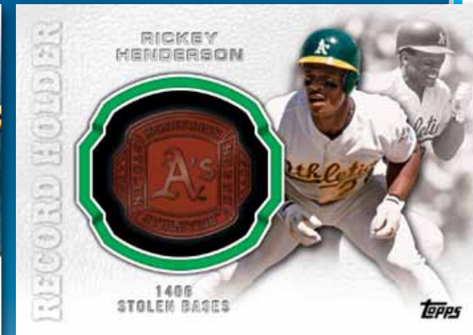
RecordHolder Ring Card