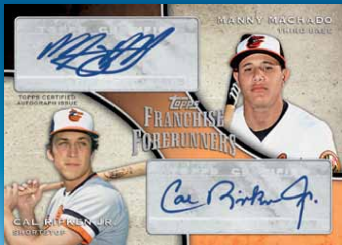
Franchise Forerunners Dual Autographed Card

Franchise Forerunners Dual Autographs – 10 dual-auto cards. Numbered to 10.