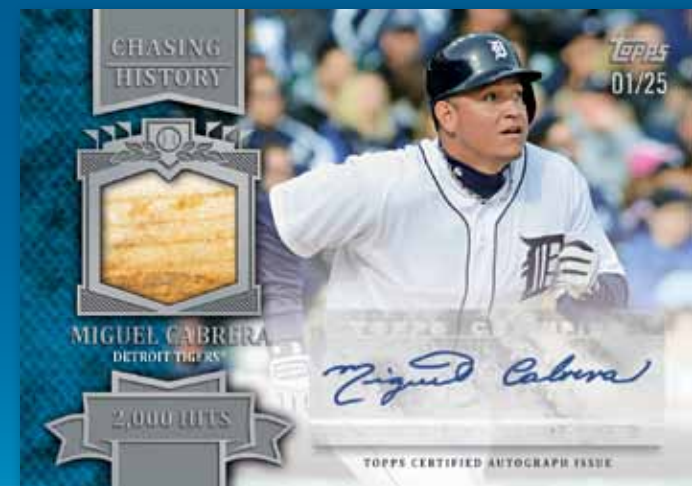
Chasing History Autographed Relic Card

Franchise Forerunners Dual Autograph Relics – 5 dual-auto/ dual-relic cards. Numbered to 5. HOBBY & HOBBY JUMBO ONLY