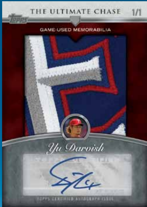
Ultimate Chase - Jumbo Patch Autographed Card

10 more individually designed and constructed cards will feature some of the biggest active and retired stars, with an autograph and a unique relic or a cut signature and a unique relic. Signed on-card! Numbered 1 of 1.