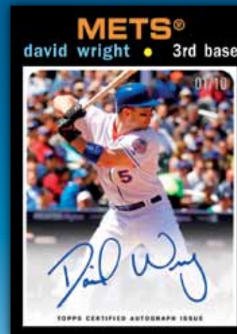
1971 Topps Mini Autographed Card