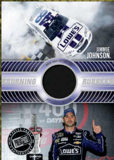
BURNING RUBBER FEATURING SWATCHES OF RACE-USED VICTORY TIRES FROM 2013 -- MULTIPLE #'D PARALLELS

ONE RACE-USED MEMORABILIA CARD IN EVERY HOBBY BOX! LOOK FOR: