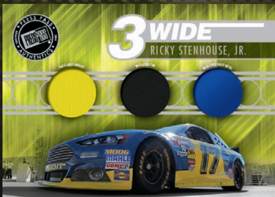
THREE WIDE FEATURING RACE-USED MEMORABILIA FROM THE DRIVER AND CAR