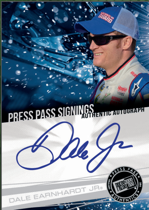
PRESS PASS SIGNINGS

NEW FOR 2014: ONE ON-CARD AUTOGRAPH AND ONE MEMORABILIA CARD IN EVERY HOBBY BOX!