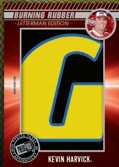
BURNING RUBBER LETTERMAN EDITION COLLECT THE LETTERS FROM THE MANUFACTURER

Set content, design, & roster subject to change.