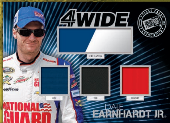
FOUR WIDE FOUR PIECES OF RACE-USED MEMORABILIA ON ONE CARD!