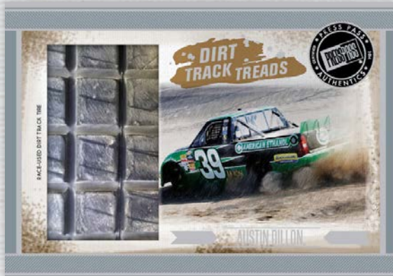
DIRT TRACK TREADS RACE-USED TIRES FROM THE INAUGURAL RACE AT ELDORA SPEEDWAY.