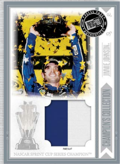
CHAMPION'S COLLECTION RACE-USED MEMORABILIA FROM THE REIGNING CHAMPION