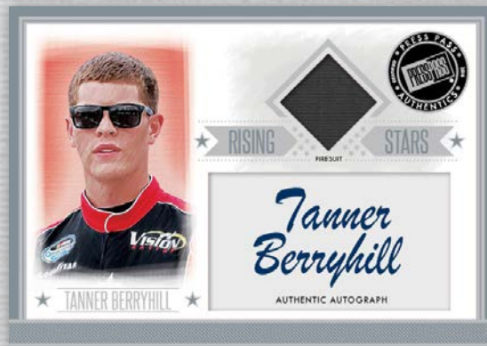
RISING STARS AUTOGRAPHED MEMORABILIA RACE-USED MEMORABILIA AND AUTOGRAPH FROM UP-AND-COMING RACING TALENT