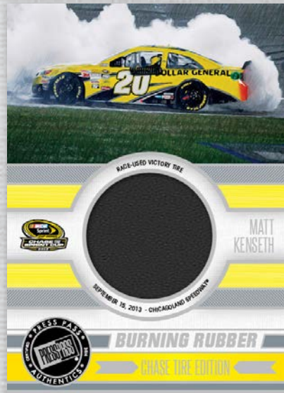
BURNING RUBBER CHASE EDITION RACE-USED WIN TIRES FROM THE LAST 10 RACES OF THE SEASON