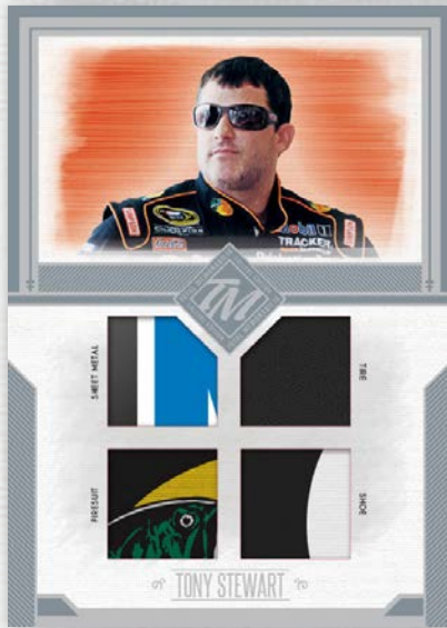
TOTAL MEMORABILIA RACE-USED MEMORABILIA FROM TOP NASCAR® DRIVERS