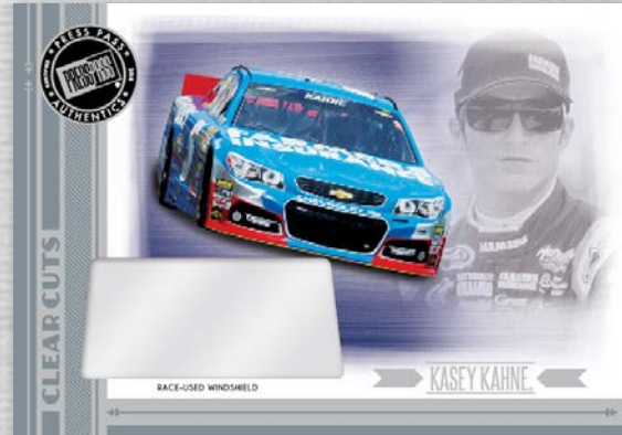
CLEAR CUTS RACE-USED WINDSHIELDS FROM TODAY'S TOP DRIVERS

Set content, design, & roster subject to change.