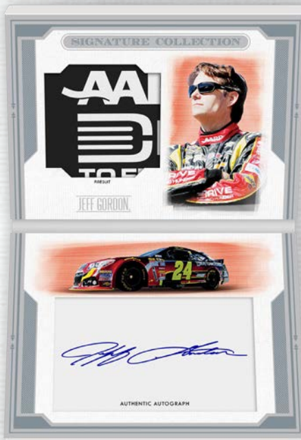
SIGNATURE COLLECTION RACE-USED MEMORABILIA AND AUTOGRAPH BOOK CARDS