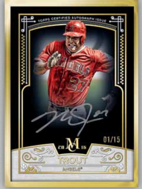
Museum Collection Card -Gold Frame