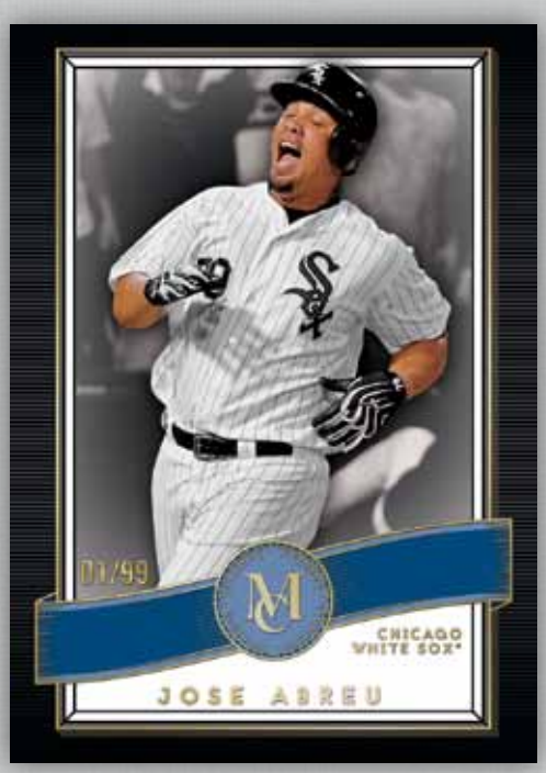
Base Cards - Blue Parallel