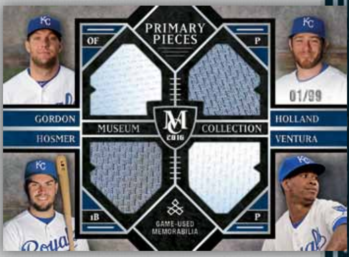
Four-Player Primary Pieces Quad Relics