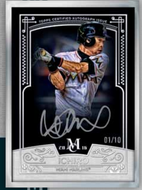
Museum Collection Card - Silver Frame

Wood Frame sequentially numbered 1 of 1.