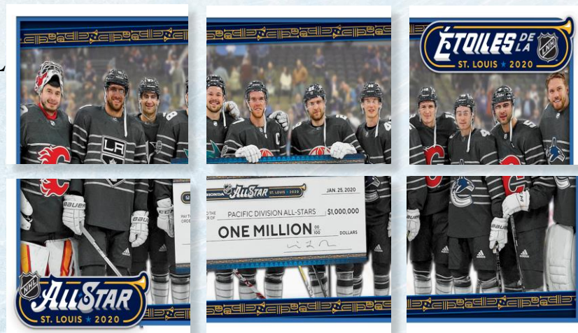
NHL® All-Star Puzzle Stickers