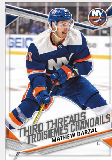
Insert - Third Threads Sticker

Collect all 670 stickers including 4 album-exclusive Photo Variants!