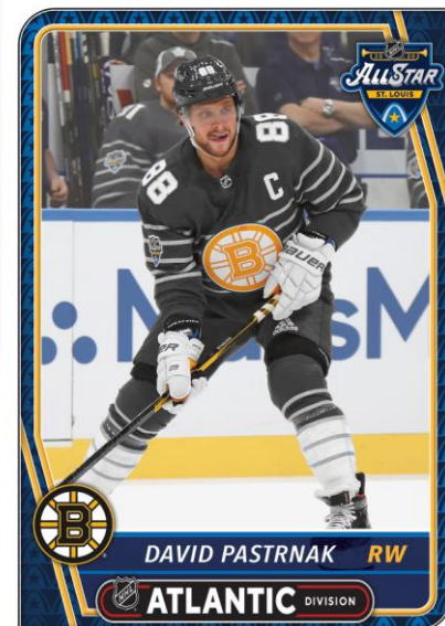
Insert - ASG Sticker