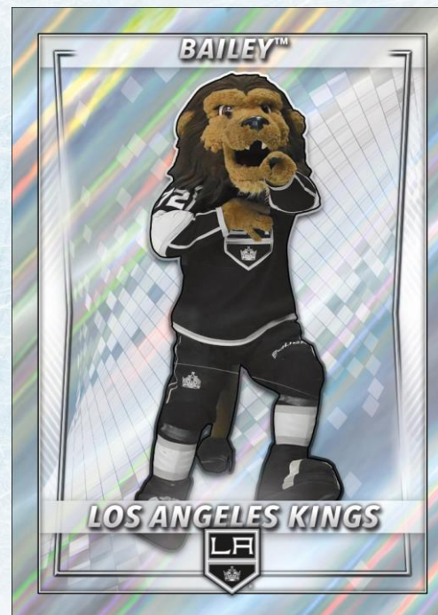
Pillar Foil Sticker