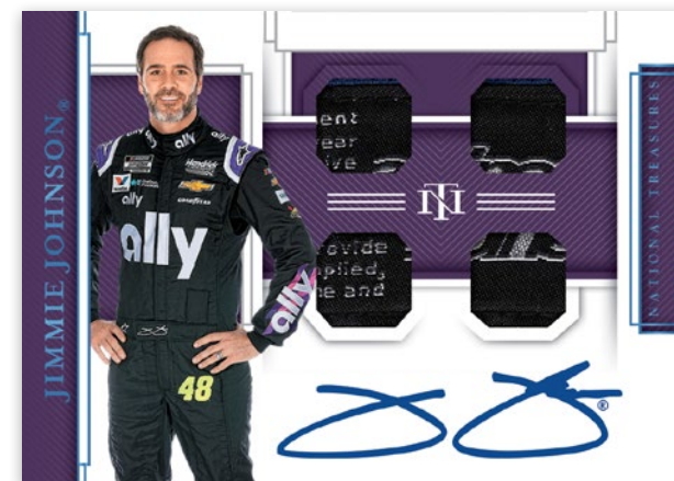
QUAD RACE GEAR GRAPHS HOLO PLATINUM BLUE

2020 National Treasures racing will feature multi-swatch cards, featuring up to four pieces of race-used material, including signed versions!