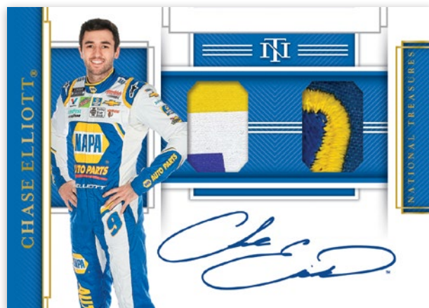
DUAL RACE GEAR GRAPHS HOLO GOLD