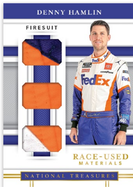
TRIPLE RACE USED FIRESUITS FIRESUITS PRIME