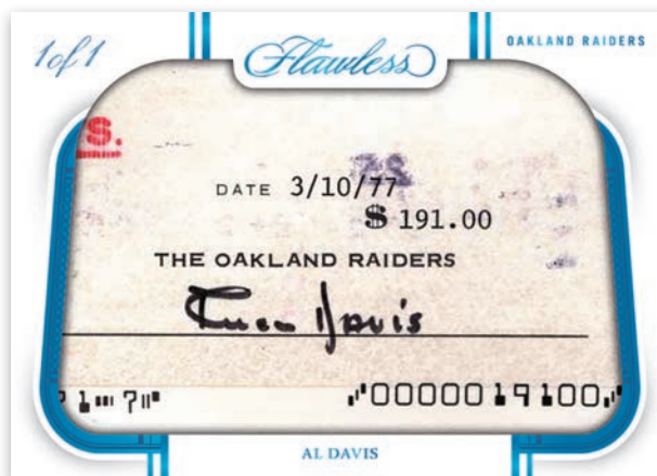
Card images are solely for the purpose of design display.