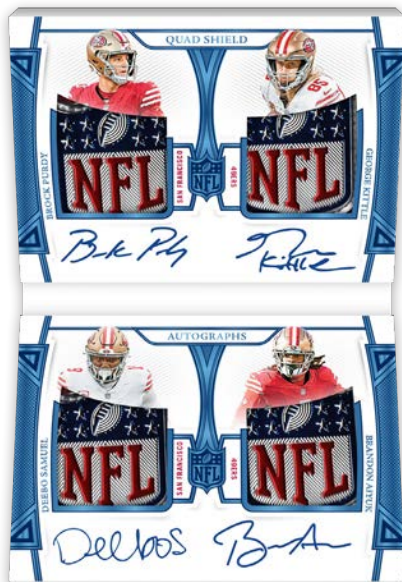
Card images are solely for the purpose of design display.