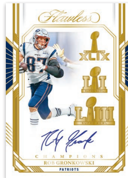
Card images are solely for the purpose of design display.